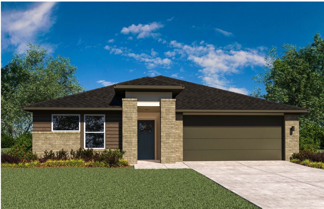
Elevation T w/ Optional Woodtone