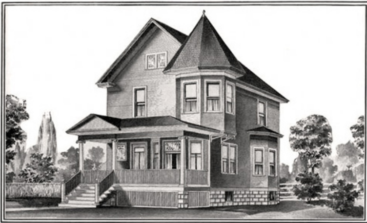
MODERN HOME No. 167

History: The home at 405 Pecore St, Houston has been confirmed by Sears Modern Homes as a Sears Kit Home No. 167, "The Maytown", pictured below (from the Sears Modern Homes Catalogue, 1916 ). The Maytown home had some options, including a wrap-around porch. Although the Harris County records show the official build date for 405 Pecore to be 1930, the house is already built at 405 Pecore on the 1924 City of Houston Sanborn map, below.