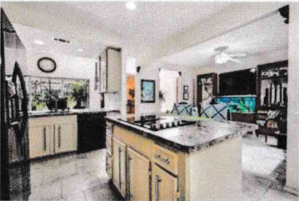
The place everyone will sure to gather, the island cooktop keeps the chef in the party.