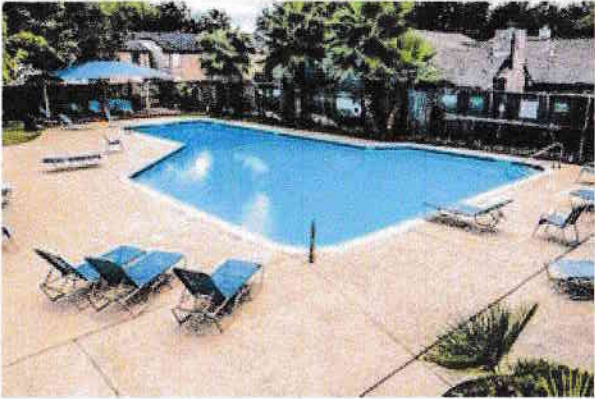
Community pool is only blocks away.