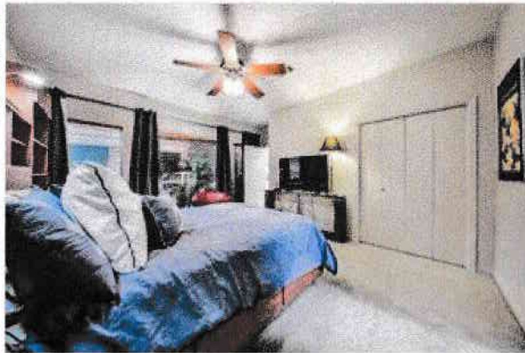
Spacious master retreat features plush carpeting, wood accents and extra closet space.