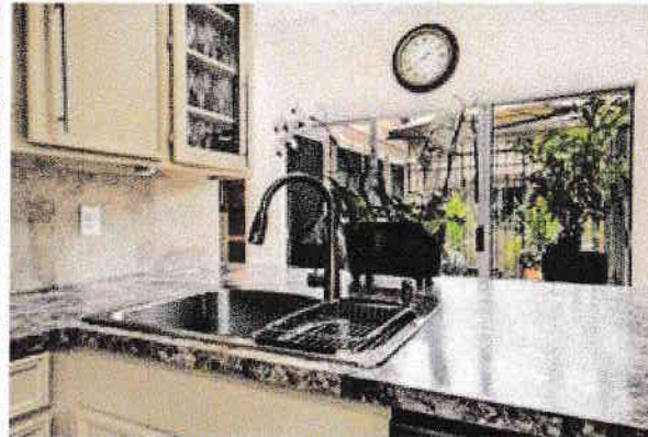
A chef's kitchen with stainless steel fixtures and endless counter and storage spaces.