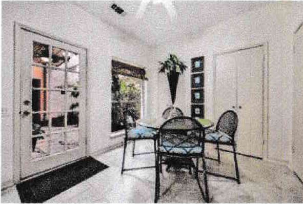
Breakfast area off the kitchen, there's plenty of pantry space for all your storage needs.