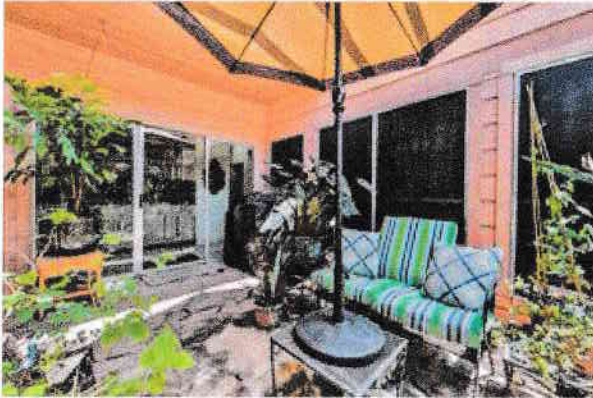
A wonderful outdoor living space to enjoy ice tea during the Texas summers or add a firepit for fall evenings.