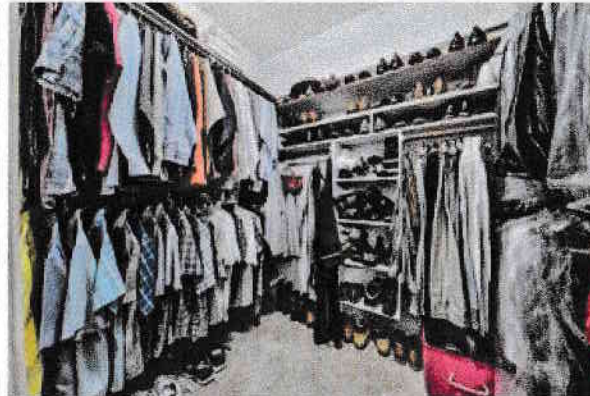
Master closet maximizes efficiency and effortlessly organizes space for shoes, accessories, and more.