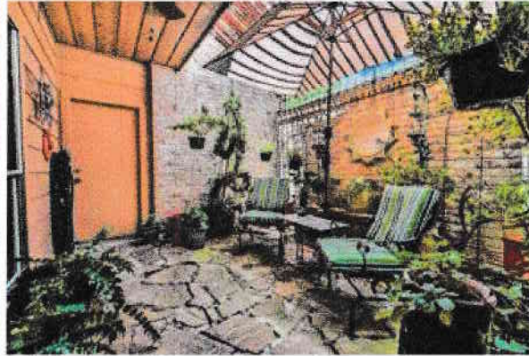
The veranda connects the garage to the breakfast area, makes bringing in the groceries a breeze.