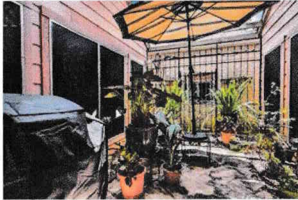
Side courtyard off the kitchen's counter makes a great space for outdoor grilling/living.