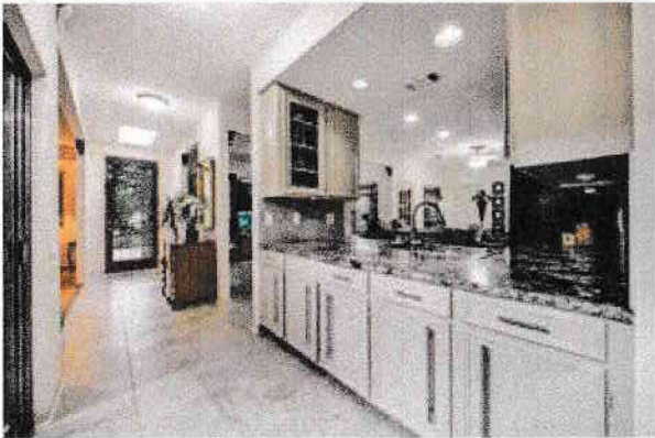
The traditional floor plan still feels quite open with wide room frames allowing views to all living areas.