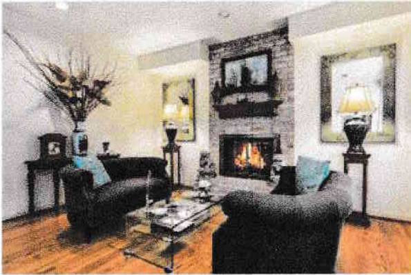
Gorgeous brick fireplace accented by rich hardwoods, the perfect ambiance for a relaxing evening.