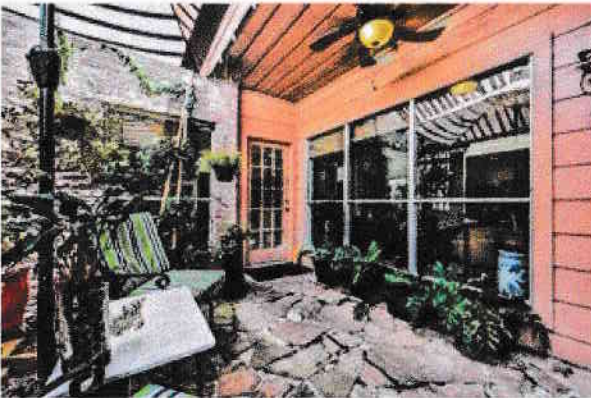
The covered veranda with brick walls feels like you're in secluded resort or a New Orleans outdoor restaurant. Your morning coffee and a book just got better.