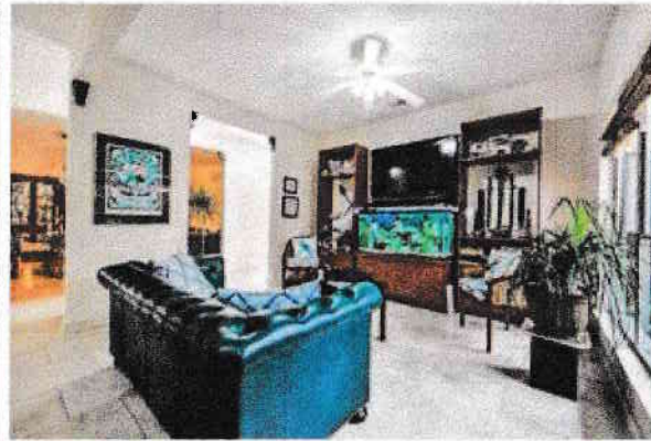
This den is magnificent! Sits off the kitchen, is sure to be the most used room in the home.