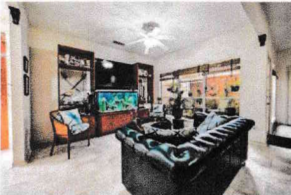
With magnificent views of the veranda, the den is a great space for watching some TV or a few minutes with a book.