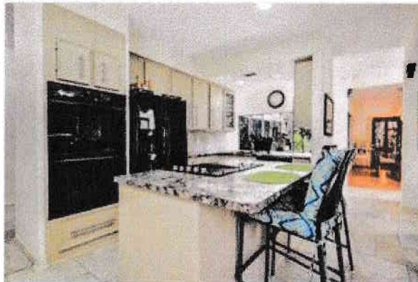
The floor plan flows effortlessly from living to kitchen, making perfect use of every square footage.