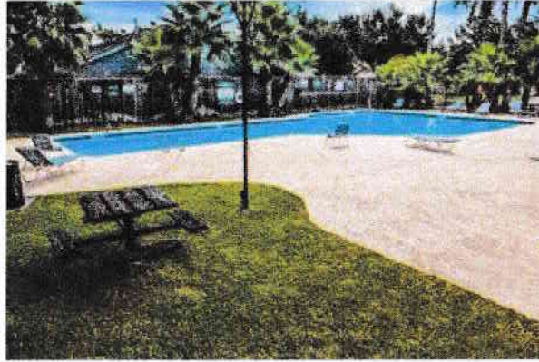
What a great space for a swim or just gathering with friends and neighbors.