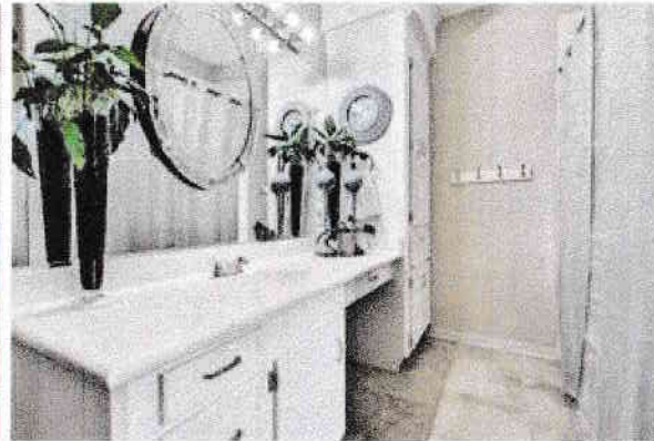
The en-suite bath is an oasis and features plenty of storage space and a vanity area.