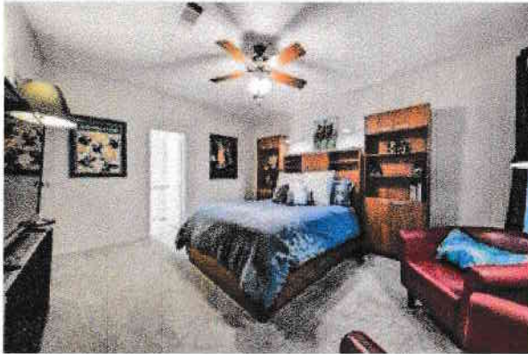
Master bedroom is large enough to add a sitting area overlooking the side courtyard.