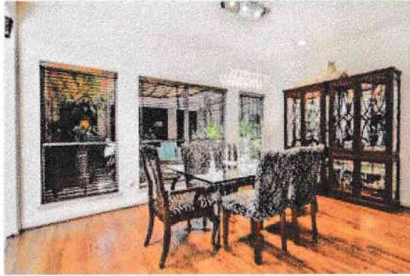
Formal dining room with an exquisite rain drop chandelier with serene views of the side courtyard.