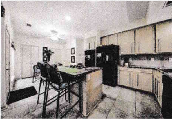
Kitchen area features beautiful Earth tones to make great use of the incoming natural light.