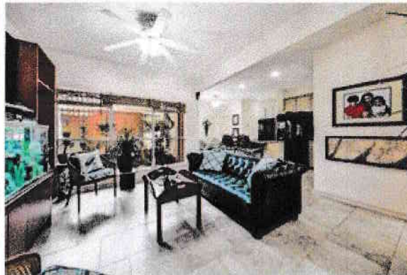
A wall of windows lets in tons of natural light! Open to breakfast and kitchen area.