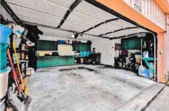
A double wide driveway with space for endless storage, work space and extra appliances.