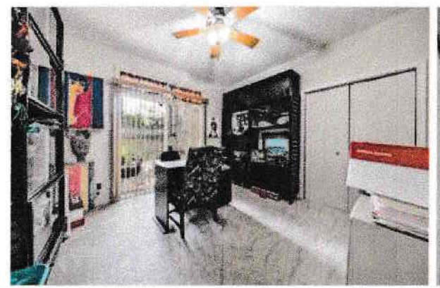
A spacious secondary bedroom currently being used as an office. This room has access to the backyard, a rare find in a patio home.