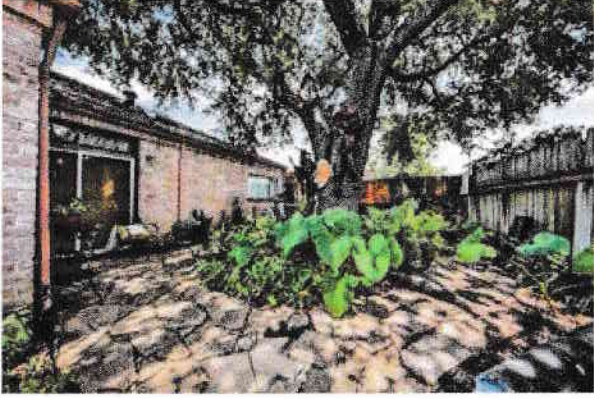
This majestic tree provides refreshing shade and rustling leaves in the cool Texas breeze.