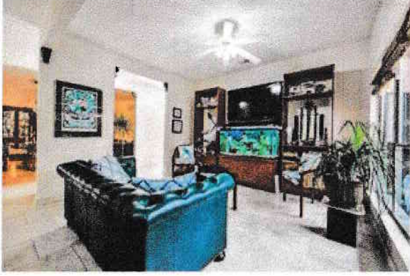
This den is magnificent! Sits off the kitchen, is sure to be the most used room in the home.