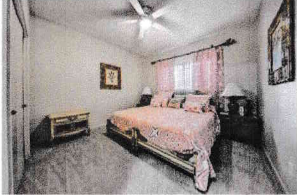
The light, bright secondary bedroom is the ideal setting for family or guests.