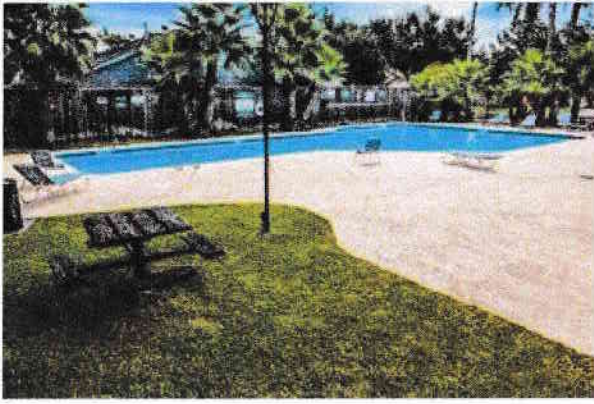
What a great space for a swim or just gathering with friends and neighbors.