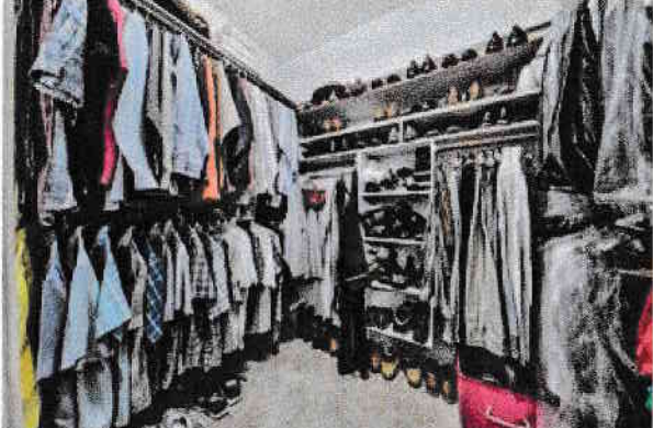
Master closet maximizes efficiency and effortlessly organizes space for shoes, accessories, and more.