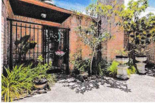
Wrought iron gate allows for additional privacy without taking away the charm of this gorgeous brick home.