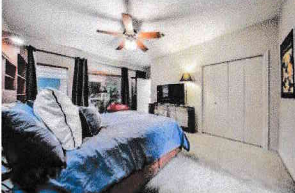
Spacious master retreat features plush carpeting, wood accents and extra closet space.