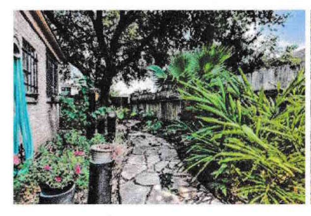
Low maintenance was the key to keeping this landscaping green and lush. Imagine never mowing the lawn ever again.