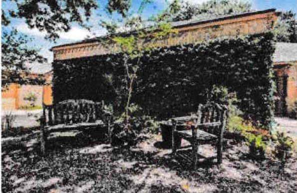
Beautiful landscaping and smart use of plants and materials create inviting sitting areas or a place to hang out with neighbors.