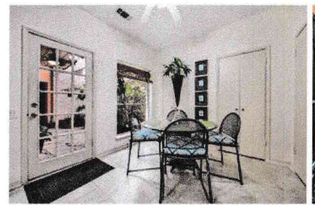
Breakfast area off the kitchen, there's plenty of pantry space for all your storage needs.