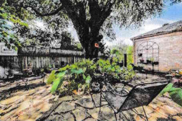
What a treat! Like having your own private oasis away from the city.