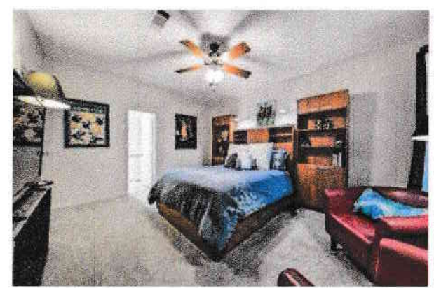
Master bedroom is large enough to add a sitting area overlooking the side courtyard.