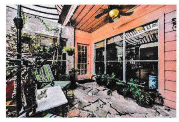
The covered veranda with brick walls feels like you're in secluded resort or a New Orleans outdoor restaurant. Your morning coffee and a book just got better.