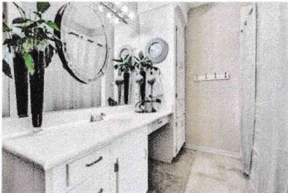
The en-suite bath is an oasis and features plenty of storage space and a vanity area.