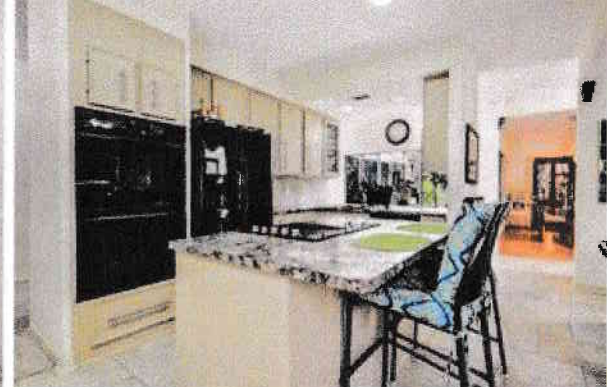
The floor plan flows effortlessly from living to kitchen, making perfect use of every square footage.