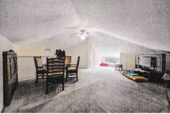
Another rare find, an extra game room upstairs featuring high traffic carpet, ceiling fan and plenty of storage space.