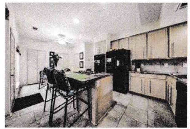
Kitchen area features beautiful Earth tones to make great use of the incoming natural light.