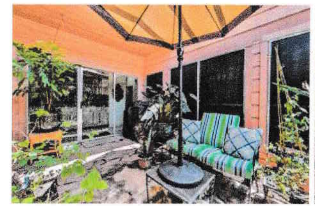
A wonderful outdoor living space to enjoy ice tea during the Texas summers or add a firepit for fall evenings.