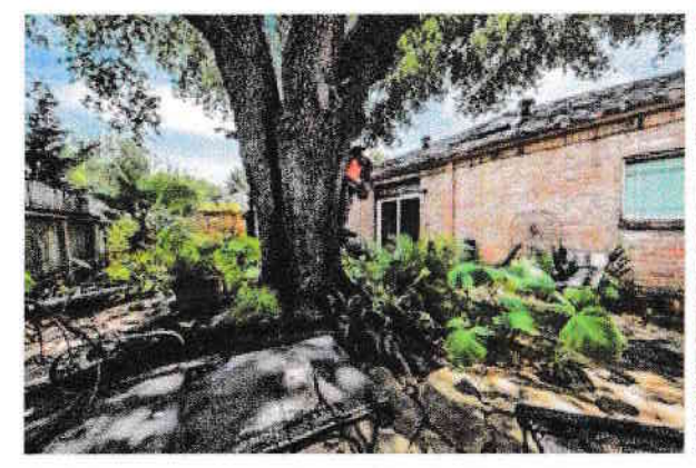
Catch some sun or relax in the shade of this mature oak tree.