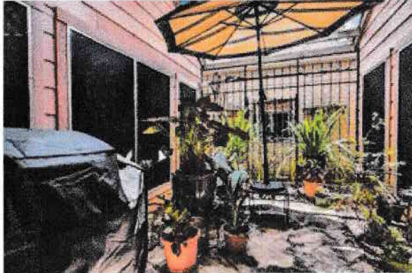
Side courtyard off the kitchen's counter makes a great space for outdoor grilling/living.