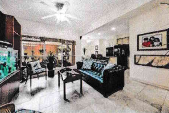
With magnificent views of the veranda, the den is a A wall of windows lets in tons of natural light! Open