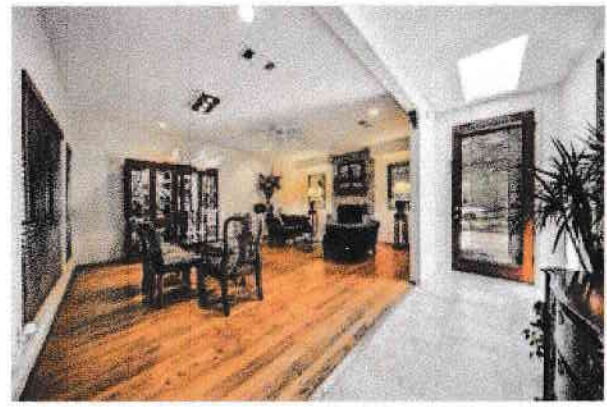
Upon entering the foyer, you are immediately greeted by wonderful natural light throughout.