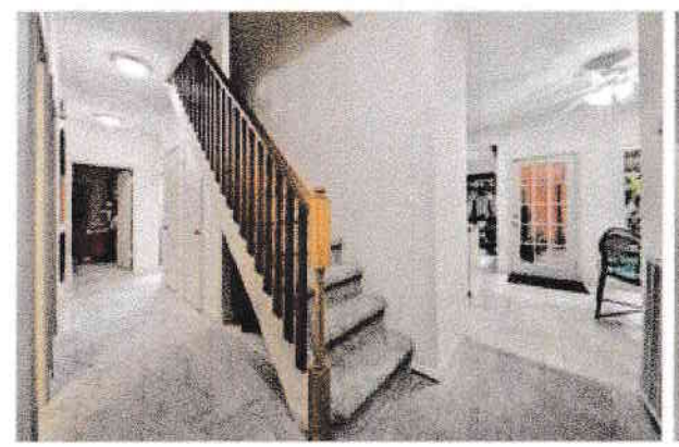
What a well executed floor plan which places all the living area in front and secludes the bedrooms to the rear of the home for privacy and quietness. The extra room upstairs creates plenty of storage space under the stairs.