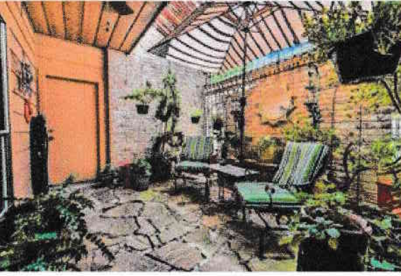
The veranda connects the garage to the breakfast area, makes bringing in the groceries a breeze.