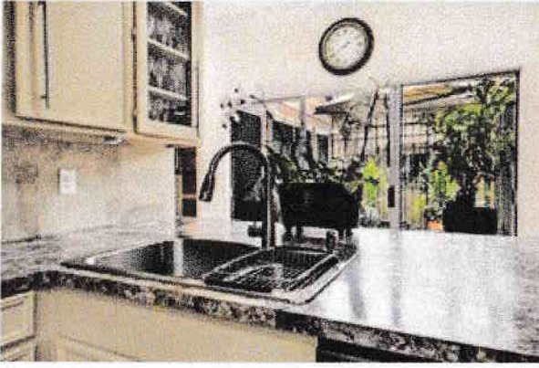
A chef's kitchen with stainless steel fixtures and endless counter and storage spaces.