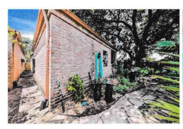
Be one of a kind with a one of a kind backyard. Note the stone pavers throughout creating tranquil trail to your outdoor spaces.