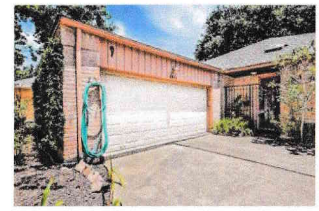
Plenty of concrete driveway for all your cars and guests.