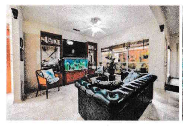
great space for watching some TV or a few minutes to breakfast and kitchen area. with a book.