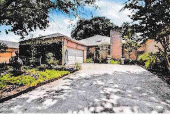
Gorgeous brick patio home nestled in the heart of Briarwood. Lush landscaping with low maintenance and easy care plants is equipped with a sprinkler system.