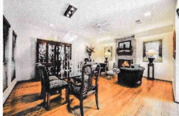
The elegant formal dining and living shared space creates an inviting place for family gatherings or game night with friends.