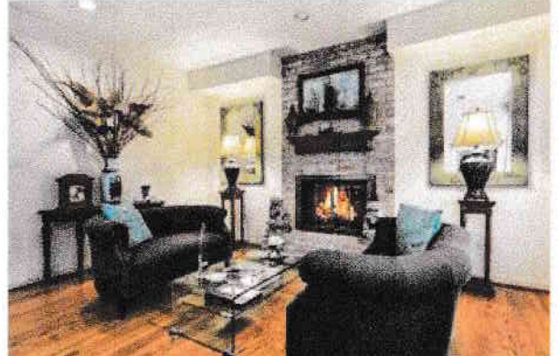
Gorgeous brick fireplace accented by rich hardwoods, the perfect ambiance for a relaxing evening.