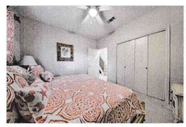
One of the two secondary bedrooms outfitted with plush carpeting and a ceiling fan. The extra large window allows copious amounts of natural light to spill in.