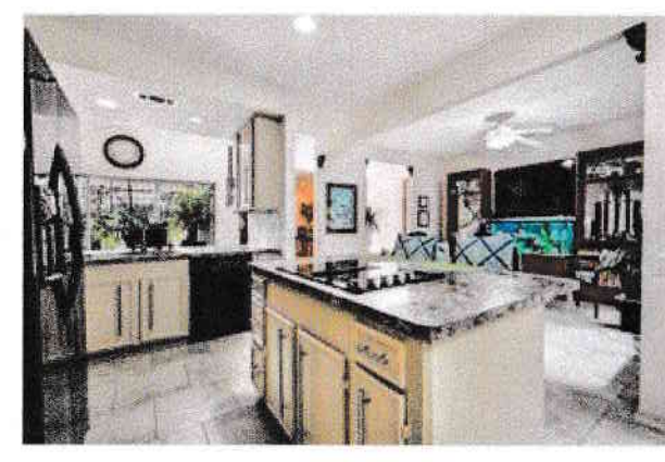
The place everyone will sure to gather, the island cooktop keeps the chef in the party.