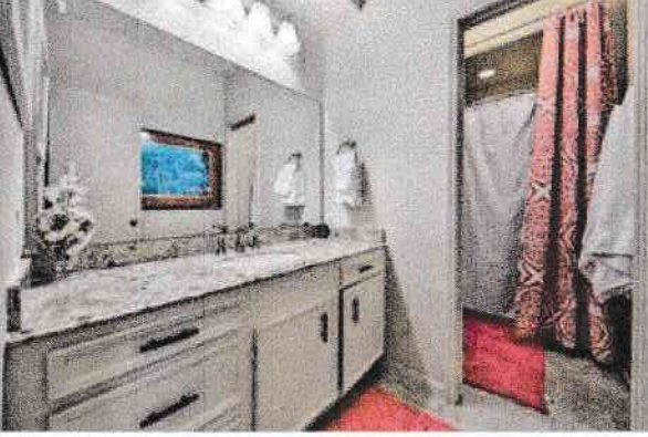
The secondary bathroom tucked between the two bedrooms features granite counters and a private shower/toilet makes getting ready for the day efficient.