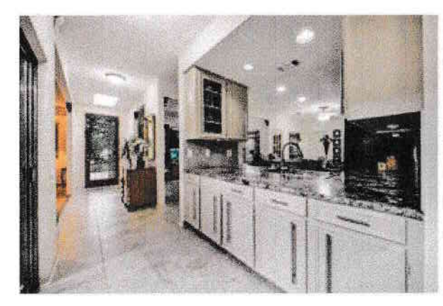
The traditional floor plan still feels quite open with wide room frames allowing views to all living areas.