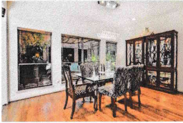
Formal dining room with an exquisite rain drop chandelier with serene views of the side courtyard.