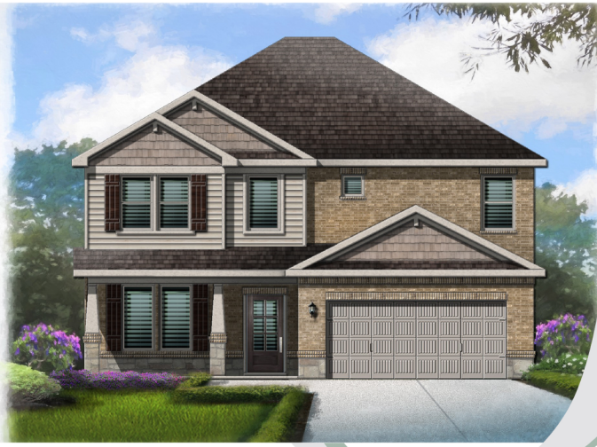
*ELEVATION PER SUBDIVISION REQUIREMENTS