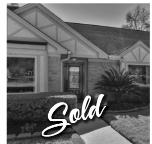
6503 Seegers Trail