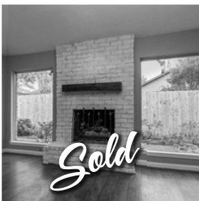
6723 Seegers Trail