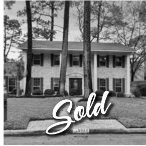
5922 Pine Arbor