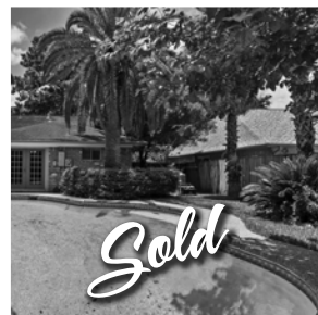
11526 Bent Trail Ct