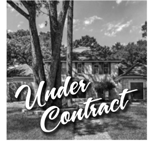
12703 Misty Valley