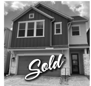
1505 Biondo Way