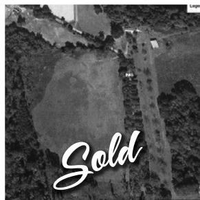
507 CR 1735