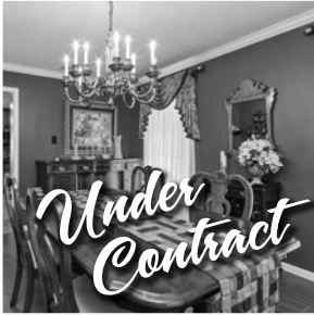
5507 Spanish Oak