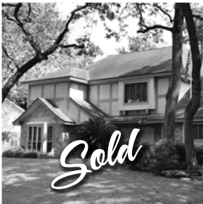
12706 Big Stone