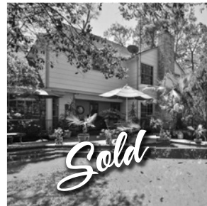
5410 Pine Arbor