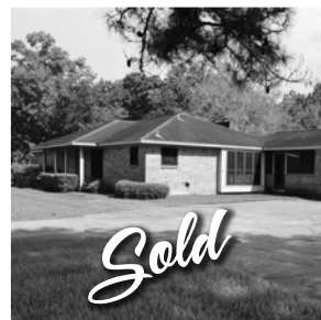
3760 CR 63