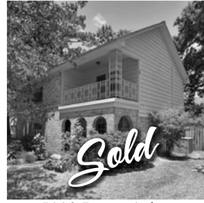
5110 Lawn Arbor