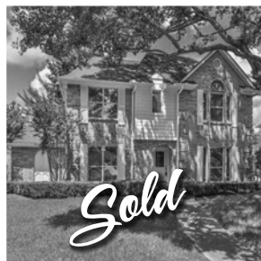
11506 Colonial Trail