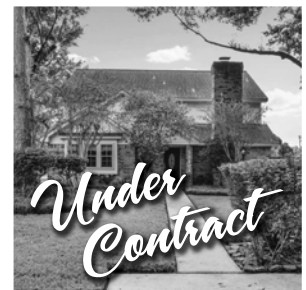
11503 Bent Trail Ct

For a Free, No Obligation, Market Analysis of Your Home, Call Me.