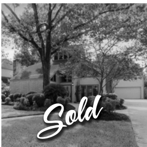
6603 Sutter Park