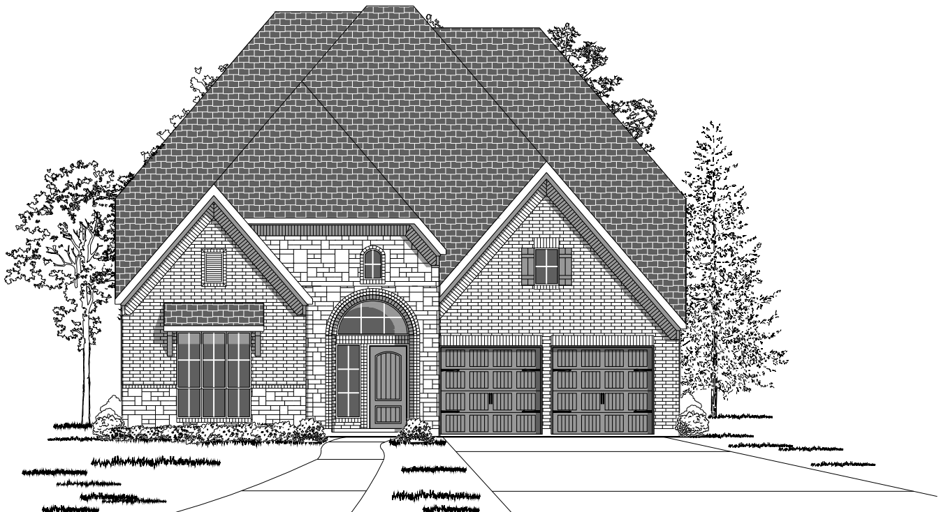
Design 3395W E-51

*See Page 3 for Details and Disclaimers. © Perry Homes, LLC 2018