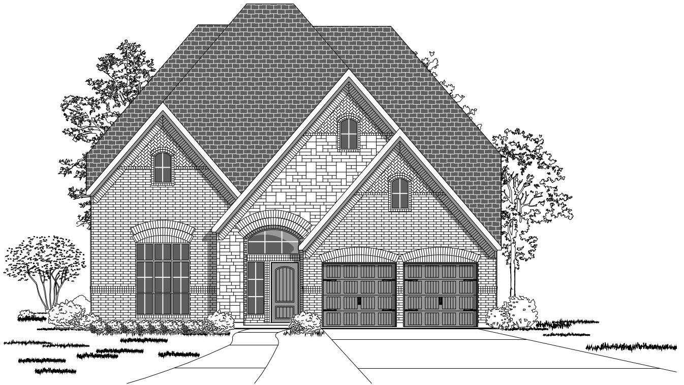
Design 3395W E-52