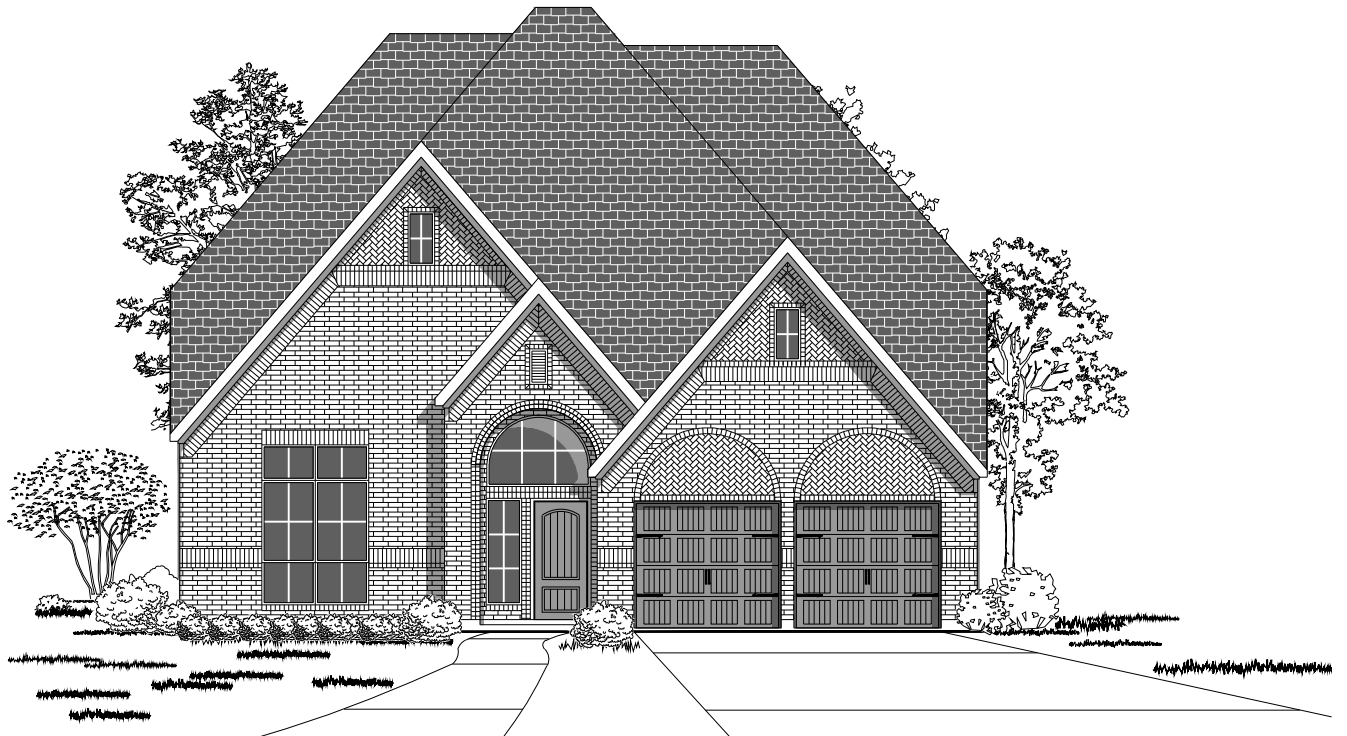
Design 3395W E-1