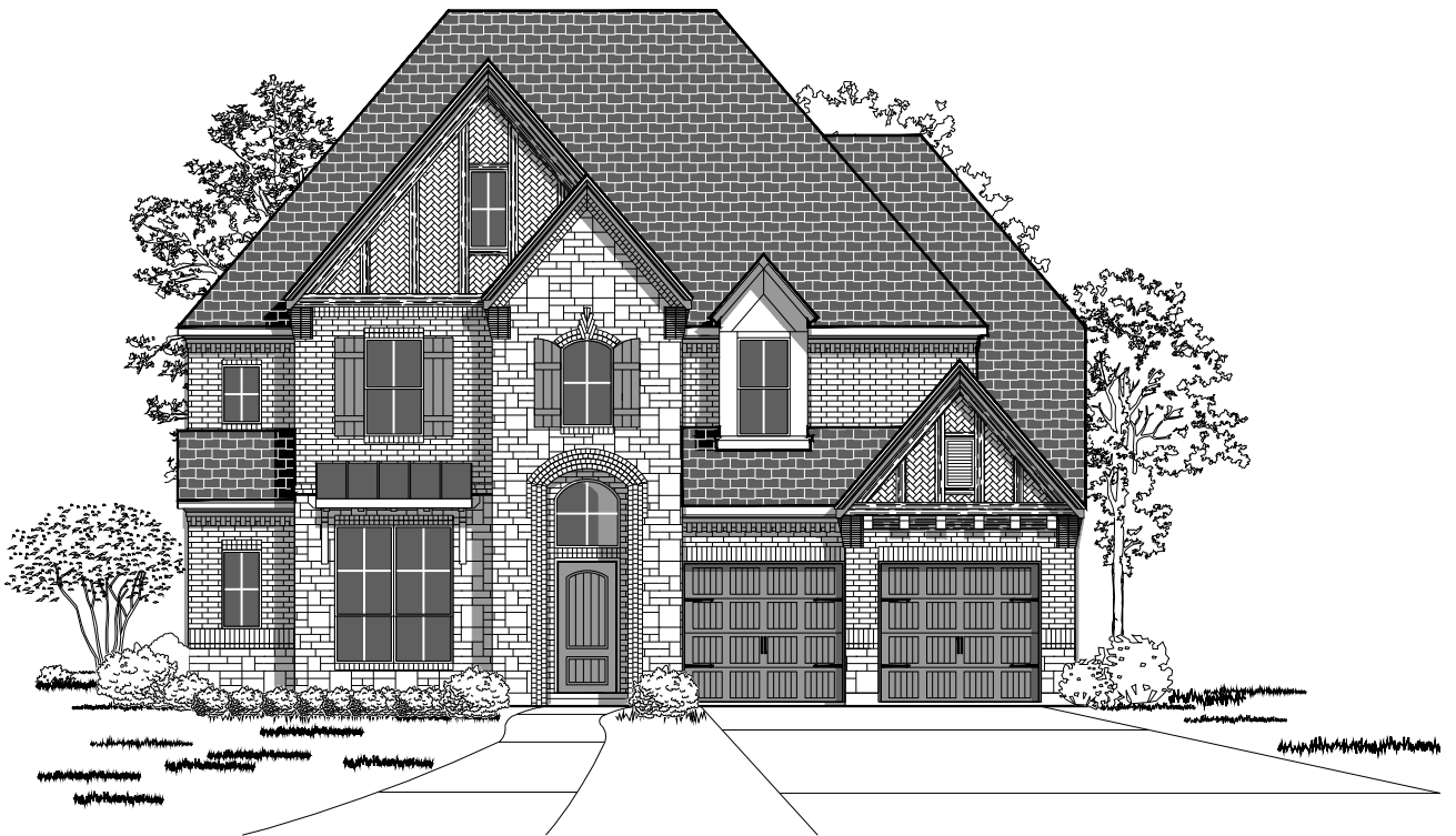
Design 3395W E-100

This design, as originally designed and prior to any changes you make, is estimated to yield approximately the number of square feet shown on page 1. All dimensions are approximate. Square footage may vary based on as-built dimensions, configurations, plan options and/or the method of calculation. Designs are not-to-scale, and are conceptual illustrations that may differ from construction plans or completed improvements. A design may depict features not available on all homesites or in all communities. Perry Homes reserves the right to make changes in plans and specifications, and to substitute material of similar quality. Prices, terms, promotions, plans, dimensions, features, options, amenities, elevations, designs, square footages, specifications, materials, and availability of homes or communities are subject to change without notice or obligation. All obligations will be governed by a written contract. This design does not constitute a commitment to build a particular floor plan or home in any given community. Some floor plans, options, and/or elevations may not be available on certain homesites or in a particular community and may require additional charges. Please check with Perry Homes to verify current offerings in the communities you are considering. This rendering is the property of Perry Homes, LLC. Any reproduction or exhibition is strictly prohibited. © Perry Homes, LLC 2015