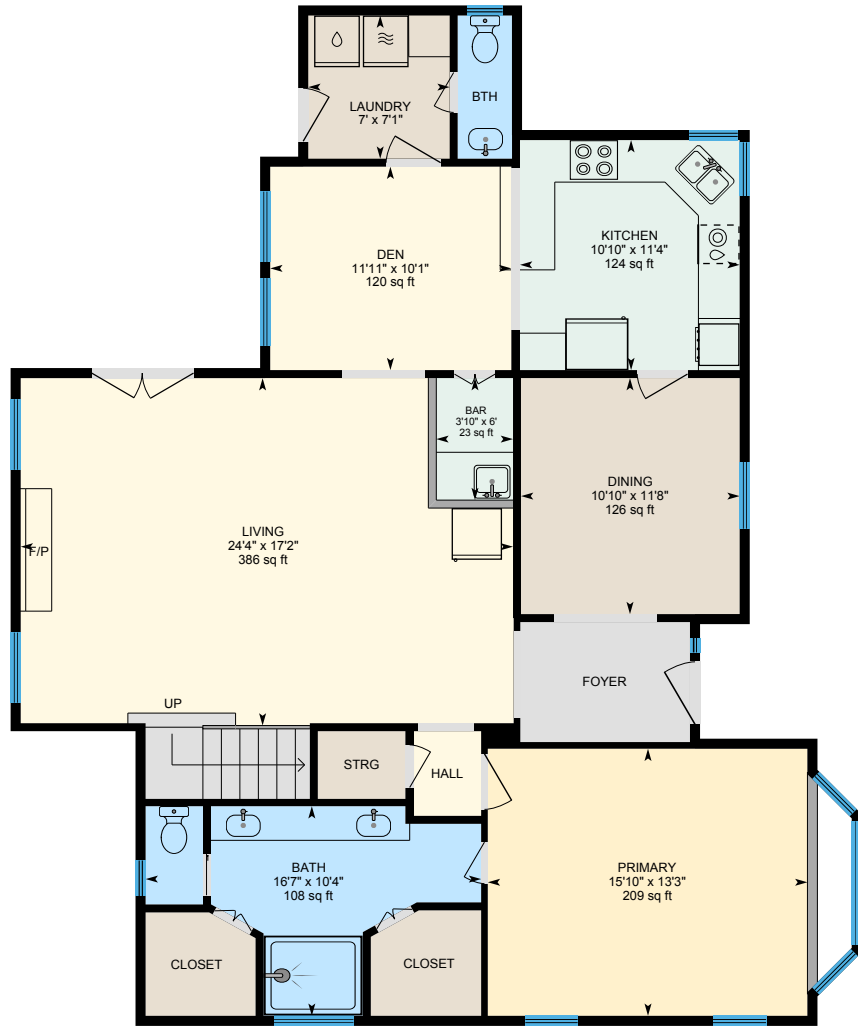
Main Floor Finished Area 1484.01 sq ft

Main Building: Above Grade Finished Area 2646.65 sq ft