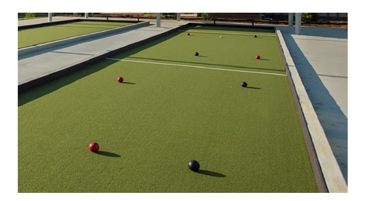
2 Bocce ball courts (bocce balls are available in The Lodge)