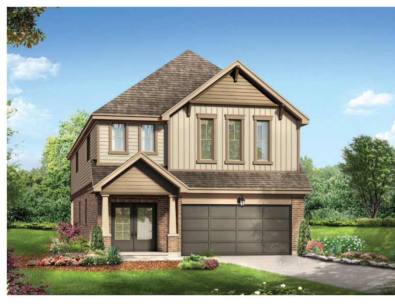
STYLE C - 2028 SQ.FT.