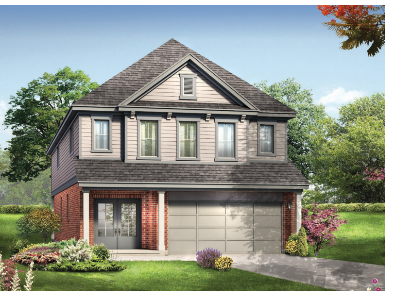
STYLE B - 2028 SQ.FT.