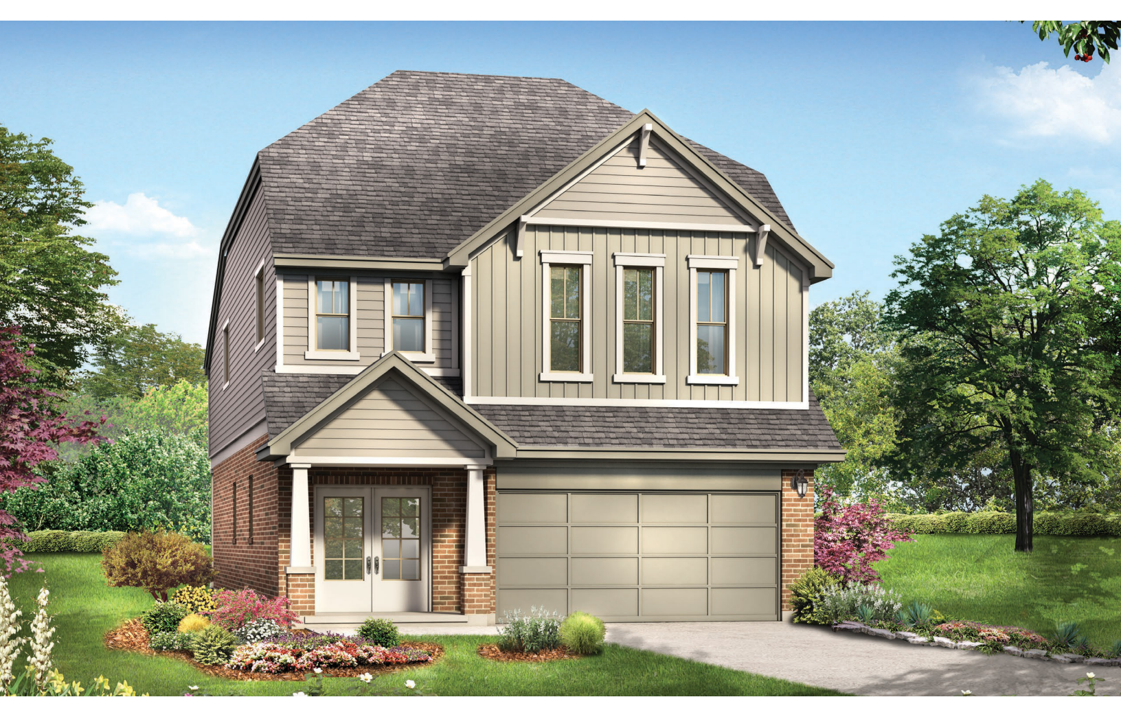
STYLE A - 2028 SQ.FT.