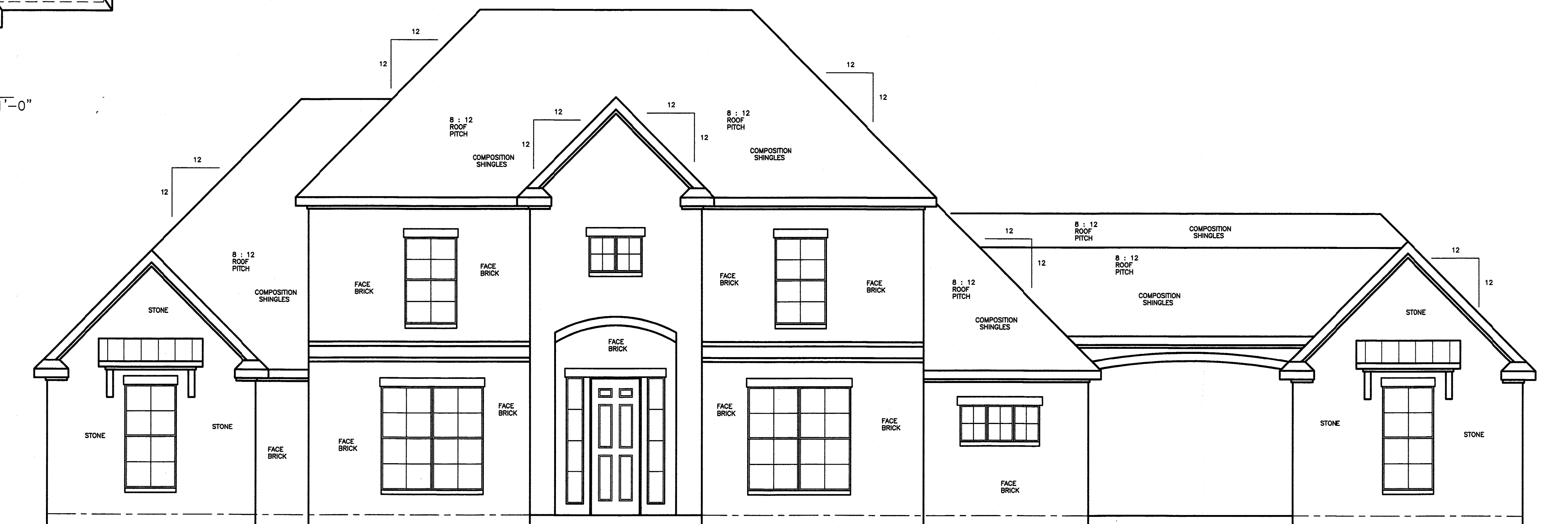
FRONT ELEVATION SCALE: 1/4"=1'-0"

KISSINGER DRAFTING & DESIGN MAY NOT BE HELD RESPONSIBLE AND ASSUMES NO LIABILITY FOR ANY HOME CONSTRUCTED FROM THESE PLANS