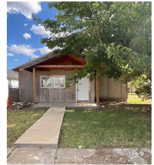
315 W GRAND ST., BORGER, TX, 79007