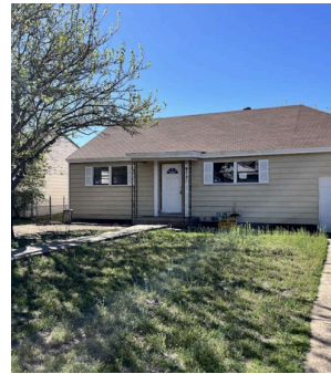
917 NELSON ST., BORGER, TX, 79007