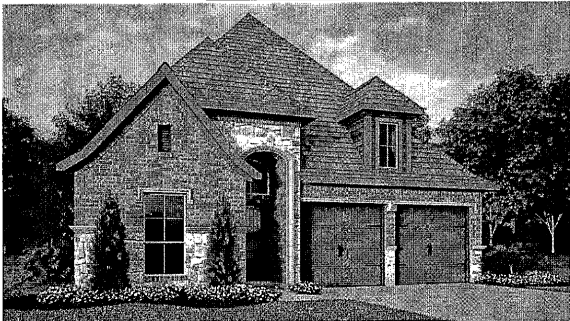
Design 2169W E-50

This design, as originally designed and prior to any changes you make, is estimated to yield approximately the number of square feet shown on page 1. All dimensions are approximate. Square footage may vary based on as-built dimensions, configurations, plan options and/or the method of calculation. Designs are not-to-scale, and are conceptual illustrations that may differ from construction plans or completed improvements. A design may depict features not available on all homesites or in all communities. Perry Homes reserves the right to make changes in plans and specifications, and to substitute material of similar quality. Prices, terms, promotions, plans, dimensions, features, options, amenities, elevations, designs, square footages, specifications, materials, and availability of homes or communities are subject to change without notice or obligation. All obligations will be governed by a written contract. This design does not constitute a commitment to build a particular floor plan or home in any given community. Some floor plans, options, and/or elevations may not be available on certain homesites or in a particular community and may require additional charges. Please check with Perry Homes to verify current offerings in the communities you are considering. This rendering is the property of Perry Homes, LLC. Any reproduction or exhibition is strictly prohibited. © Perry Homes, LLC 2019