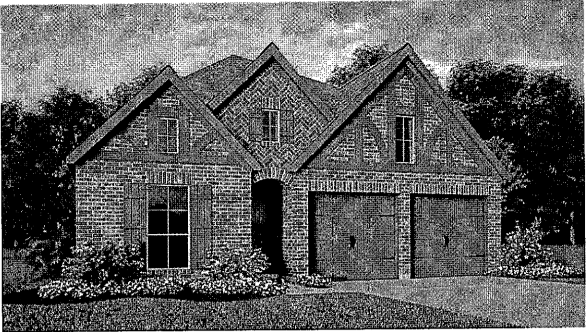
Design 2169W E-1