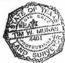
EXHIBIT "A" Page 2 of 2