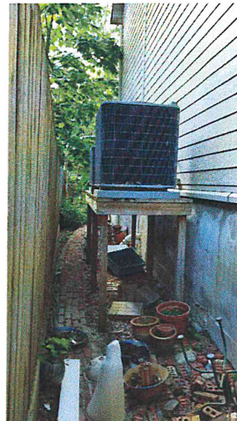
Photo One Caption RIGHT SIDE & AC UNIT VIEW - TAKEN 4-29-19