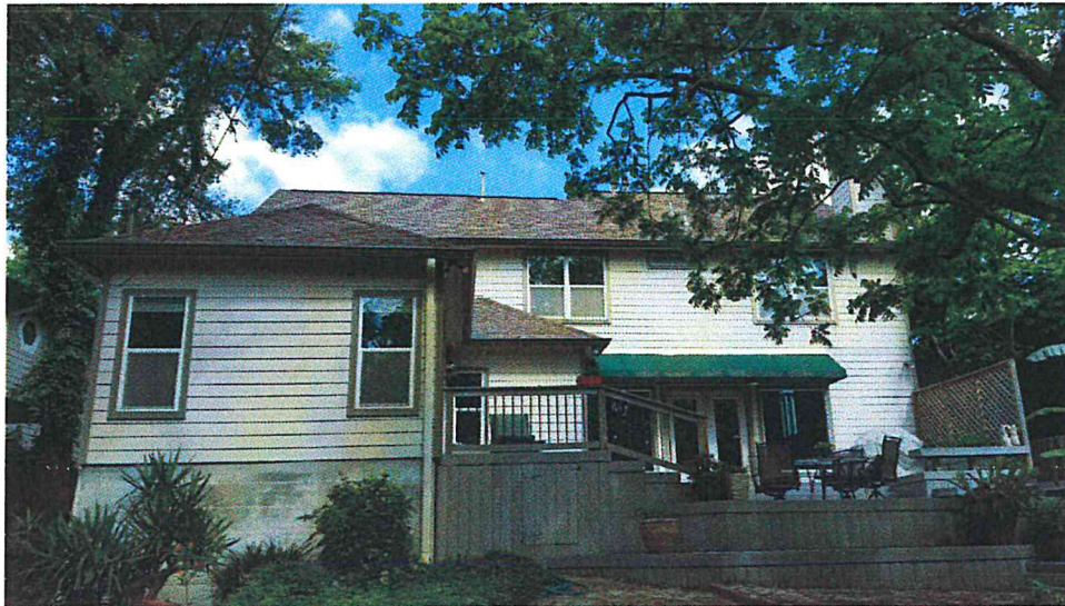
Photo Two Caption REAR VIEW - TAKEN 4-29-19