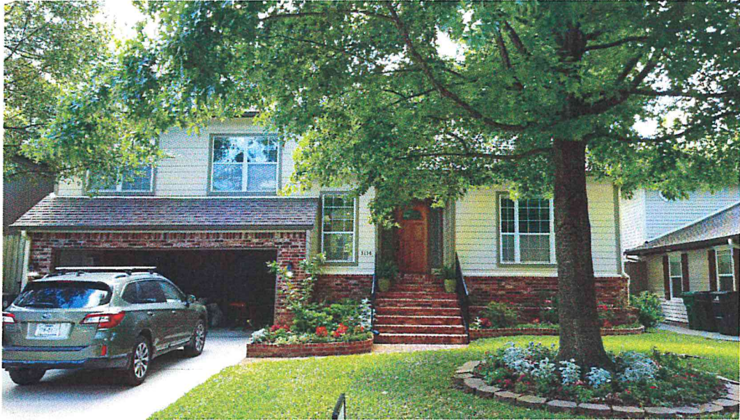
Photo One Caption FRONT VIEW - TAKEN 4-29-19

If using the Elevation Certificate to obtain NFIP flood insurance, affix at least 2 building photographs below according to the instructions for Item A6. Identify all photographs with date taken; "Front View" and "Rear View"; and, if required, "Right Side View" and "Left Side View." When applicable, photographs must show the foundation with representative examples of the flood openings or vents, as indicated in Section A8. If submitting more photographs than will fit on this page, use the Continuation Page.