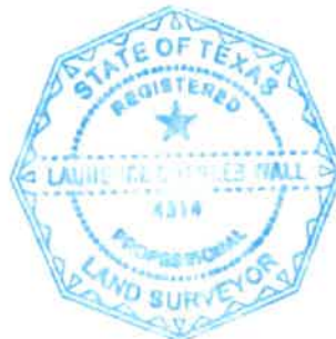
Laurence C. Wall RPLS #4814 April 8, 2016

This description has been prepared in conjunction with the survey plat attached hereto. Bearings described are assumed based on the right-of-way of Avenue M. Distances are true ground distances.