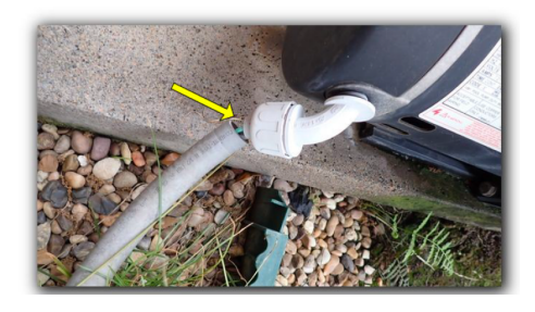
Pool Equipment was modified what was removed a cleaning pump or a water feature : Ask Agent

Repair conduit that is not secured and the wiring is exposed