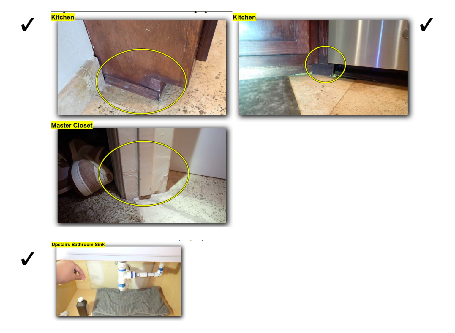
Page 16: Repair wood rot around house, garage and doors it's been painted over