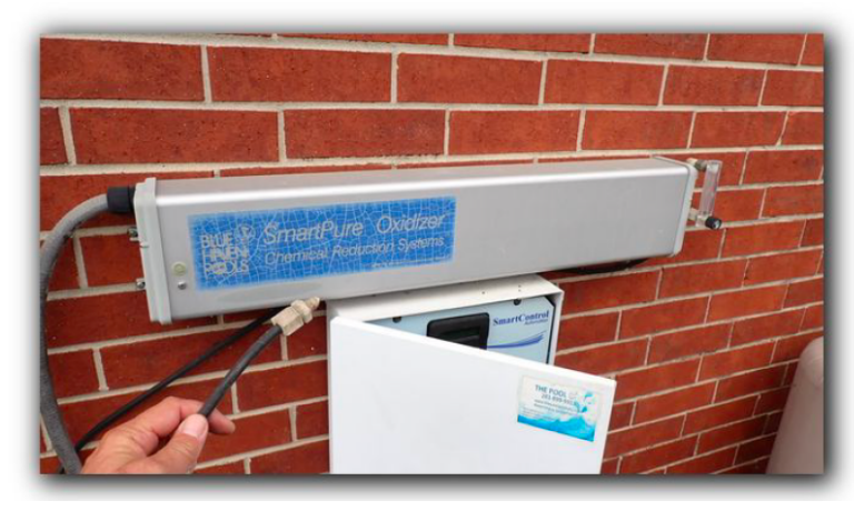
Repair Leaks at the pumps and filter area of the pool