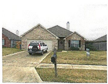
309 Glenview Drive Aubrey, Texas

LEGEND - C.M.= Controlling Monument; F.I.R.= Found Iron Rod; F.I.P.= Found Iron Pipe; F.C.P.= Fence Corner Post. O.H.E.=Overhead Electric. S.I.R.= Set Iron Rods 1/2" diameter with yellow cap stamped "Arthur Surveying Company". All found iron rods are 1/2" diameter unless otherwise noted. — X — (fence/ C post) — O.H.E. — (overhead power) FLOOD NOTE: It is my opinion that the property described hereon is not within the 100-year flood zone area according to the Federal Emergency Management Agency Flood Insurance Rate Map Community-Panel No. 480776 0265 G, present effective date of map, April 18, 2011, herein property situated within Zone "X".