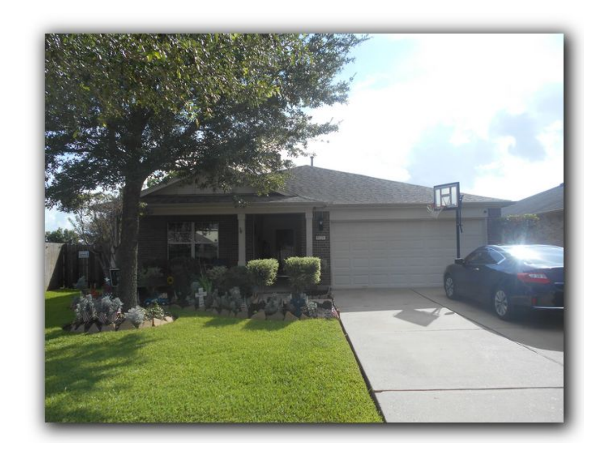
8126 Clover Leaf Drive Rosenberg, Texas 77469