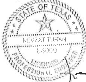
Nevzat Turan, P.E. Principal

I certify that all closure activities were completed in accordance with the Site Development Plan (SDP), Site Operating Plan (SOP), and Title 30 TAC §330.459 - "Closure Requirements for Municipal Solid Waste Storage and Processing Units."