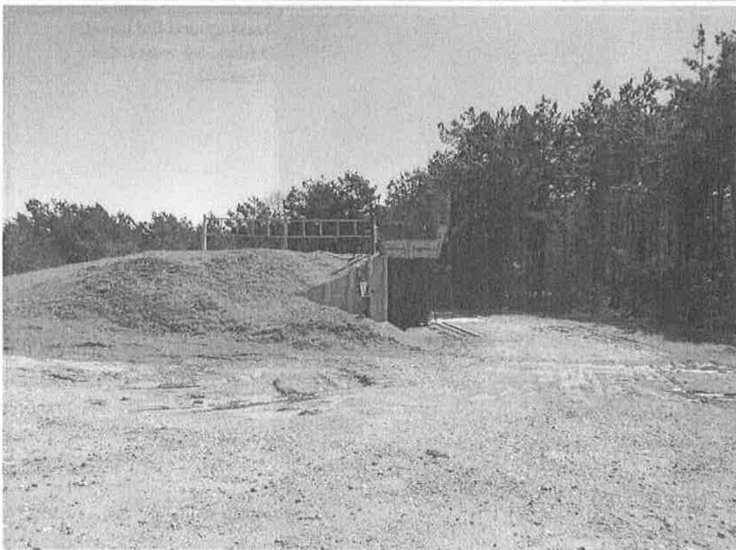
Photo of the transfer station.

Building next to the transfer station. No waste was observed inside.