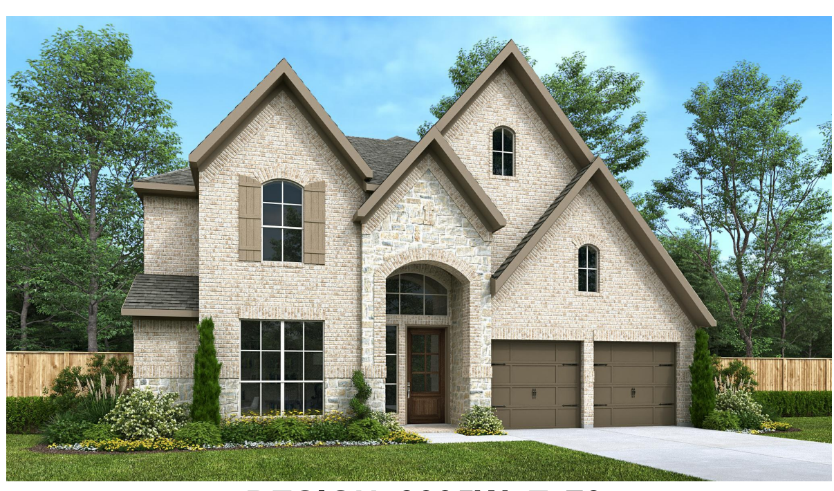
DESIGN 3095W E-70

This design, as originally designed and prior to any changes you make, is estimated to yield approximately the number of square feet shown on page 1. All dimensions are approximate. Square footage may vary based on as-built dimensions, configurations, plan options and/or the method of calculation. Designs are not-to-scale, and are conceptual illustrations that may differ from construction plans or completed improvements. A design may depict features not available on all homesites or in all communities. Perry Homes reserves the right to make changes in plans and specifications, and to substitute material of similar quality. Prices, terms, promotions, plans, dimensions, features, options, amenities, elevations, designs, square footages, specifications, materials, and availability of homes or communities to change without notice or obligation. All obligations will be governed by a written contract. This design does not constitute a commitment to build a particular floor plan or home in any given community. Some floor plans, options, and/or elevations may not be available on certain homesites or in a particular community and may require additional charges. Please check with Perry Homes to verify current offerings in the communities and are considering. This rendering is the property of Perry Homes. LLC. Any reproduction or exhibition is strictly prohibited @ Perry Homes LLC. 2012