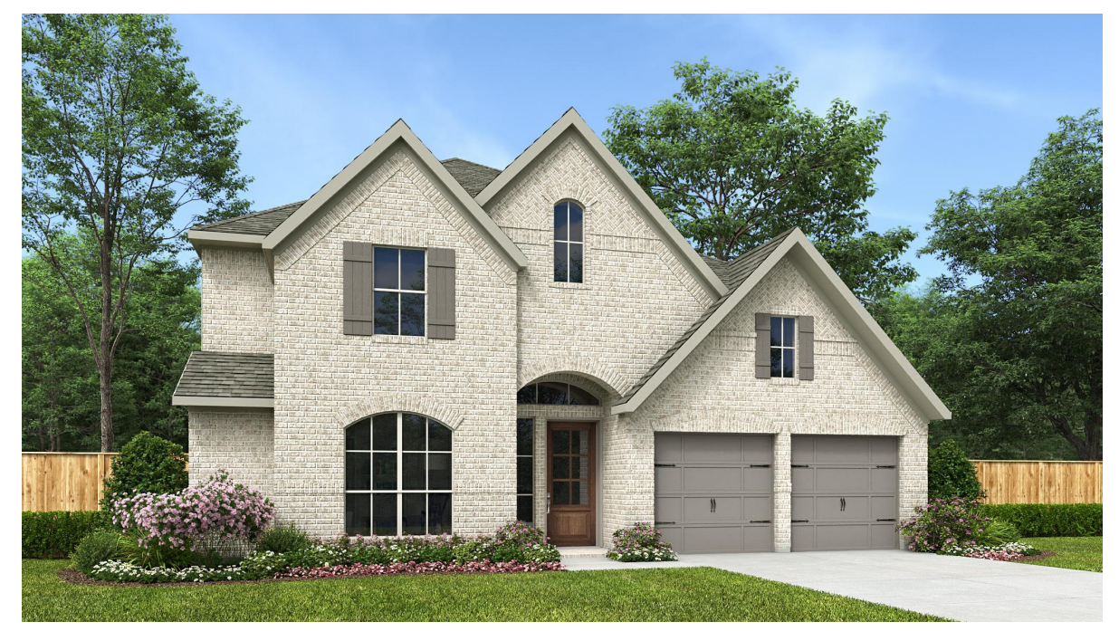
DESIGN 3095W E-1