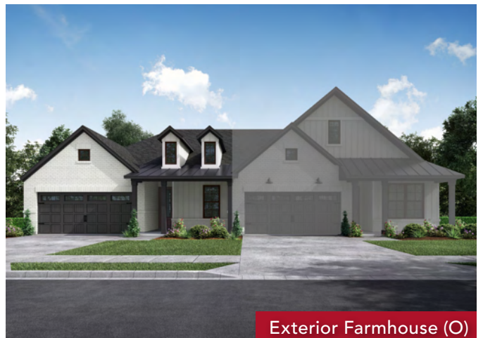
Exterior Farmhouse (O)