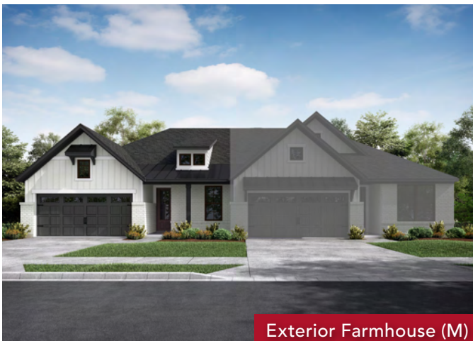
Exterior Farmhouse (M)