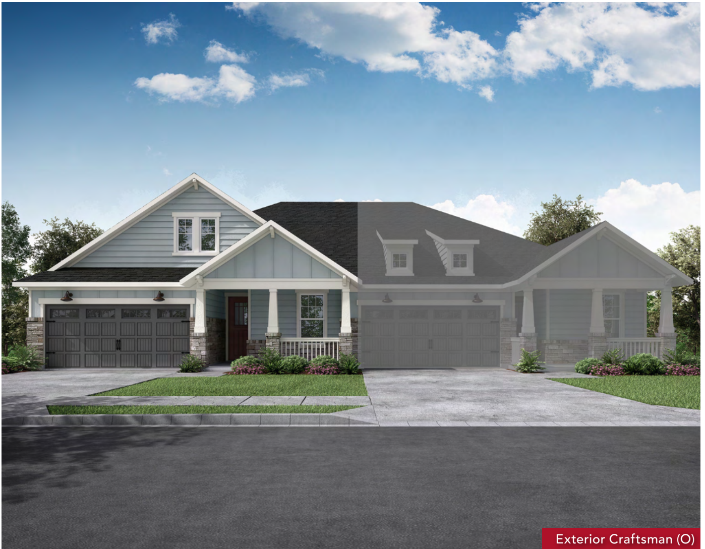
Exterior Craftsman (O)

3 Bedrooms / 2 Bathrooms From 1,794 SqFt 2-Car Garage