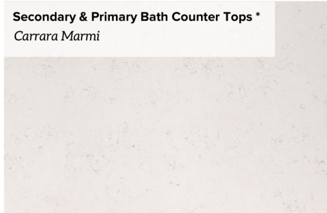
Secondary & Primary Bath Counter Tops * Carrara Marmi