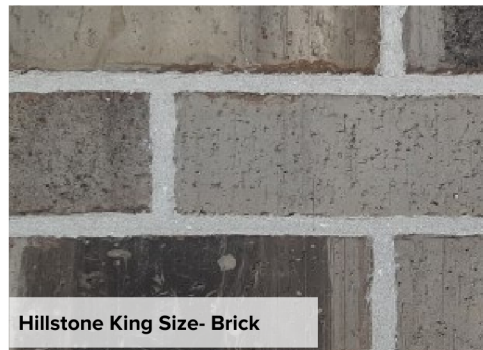
Hillstone King Size- Brick