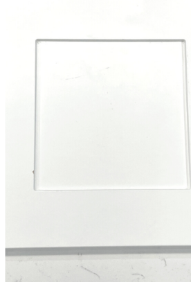
Primary & Secondary Bath Cabinets * Milano 18 Roundover | Extra White