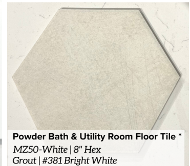
Powder Bath & Utility Room Floor Tile * MZ50-White | 8" Hex Grout | #381 Bright White