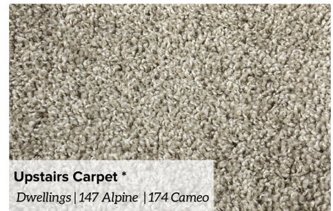
Upstairs Carpet * Dwellings | 147 Alpine | 174 Cameo