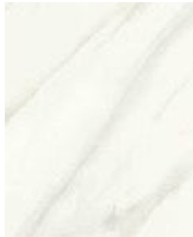
Primary Bath & Secondary Bath Floor Tile * FL06-Carrar | 12 x 24 Grout | #545 Bleached Wood