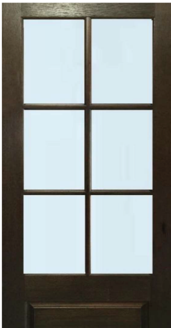
Front Door * Marginal 6 Lite- 8' Over Panel w/ Flemish Glass Ebony Stain