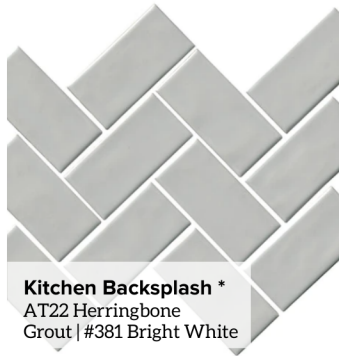
Kitchen Backsplash * AT22 Herringbone Grout | #381 Bright White