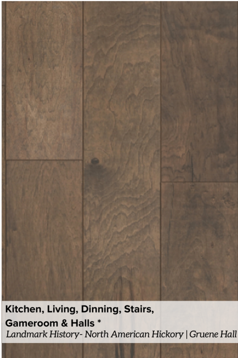
Kitchen, Living, Dining, Stairs, Gameroom & Halls * Landmark History- North American Hickory | Gruene Hall