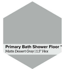
Primary Bath Shower Floor * Matte Dessert Gray | 1.5" Hex