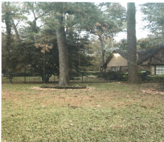
LEFT SIDE VIEW (12-01-15)