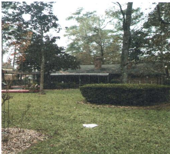
REAR VIEW (12-01-15)