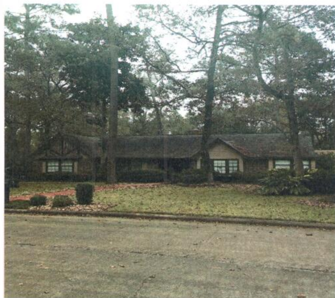
FRONT VIEW (12-01-15)