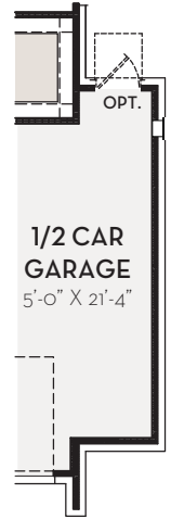
OPT. 1/2 CAR GARAGE OR PER ELEVATION 115 SQ. FT.