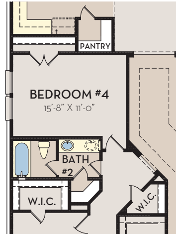
OPT. BEDROOM #4 IN LIEU OF STUDY