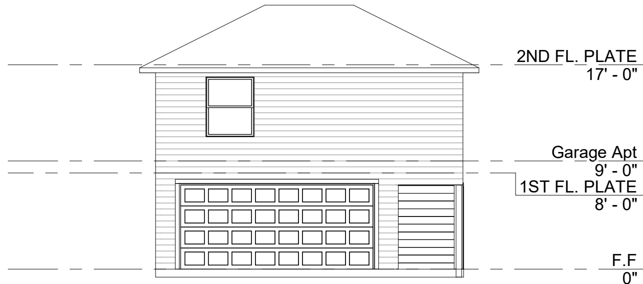
③ GARAGE FRONT 1/8" = 1'-0"

GARAGE: 368 SQFT GARAGE APT: 465 SQFT TOTAL: 833 SQFT