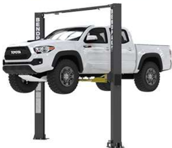
BendPak XPR-10AXLS-181 - XPR-10AXLS-LP-181