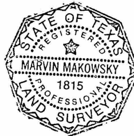
EXHIBIT A, sheet 2 of 2