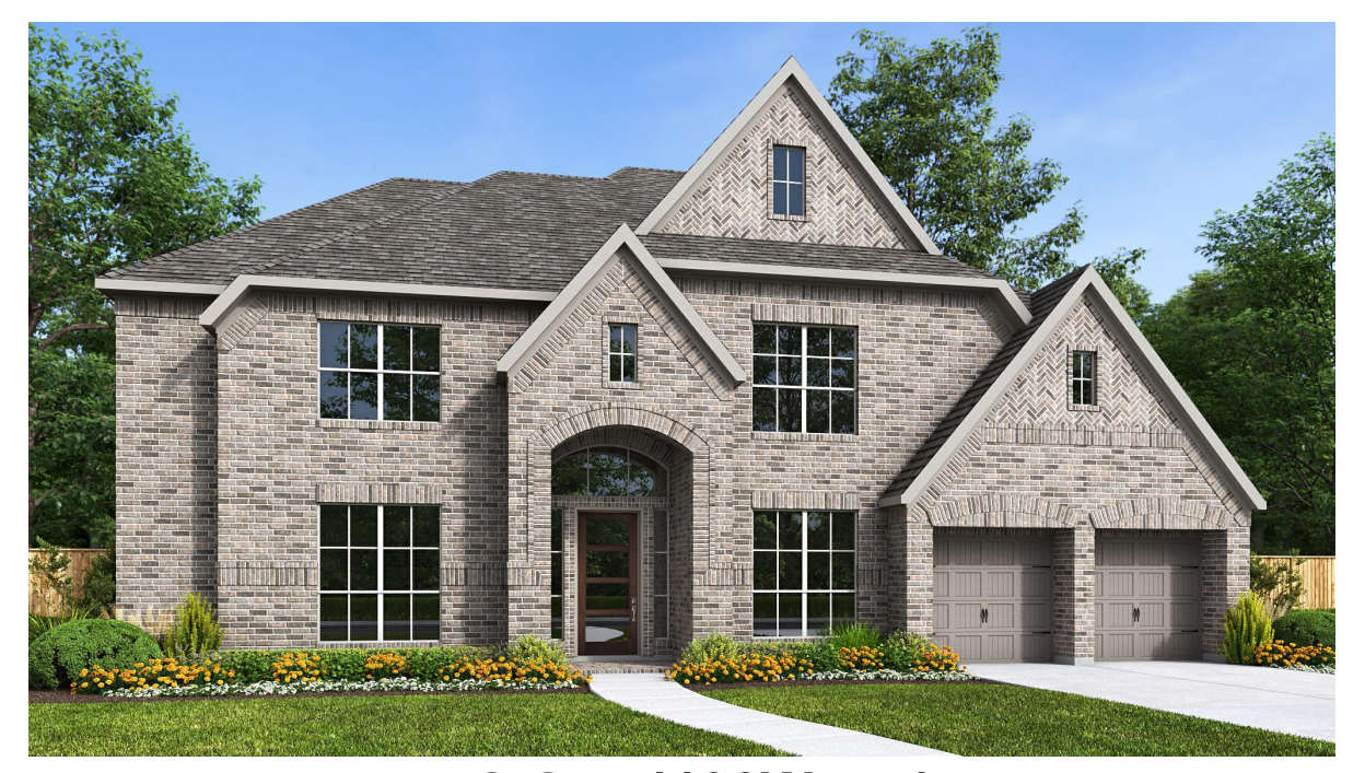
DESIGN 4190W E-1