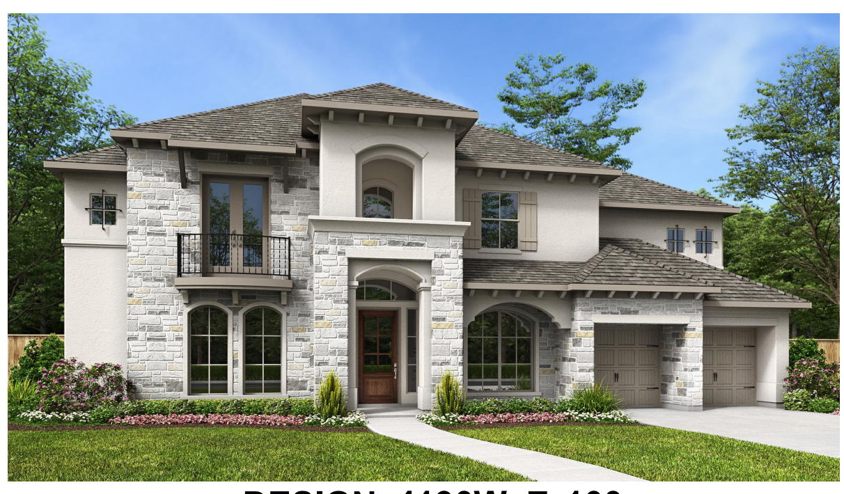
DESIGN 4190W E-100