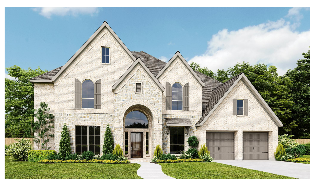
DESIGN 4190W E-70