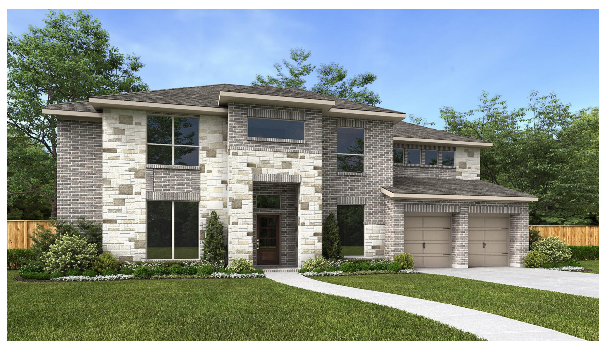
DESIGN 4190W E-52

In sesignt, as originary designed and prior to any charges your make, is estimated to yield approximately fire further or square feet solution construction plans or completed improvements. A design may depict features not available on all homesites or in all communities. Perry Homes reserves the right to make changes in plans and specifications, and to substitute material of similar quality. Prices, terms, promotions, plans, dimensions, features, options, amentities, elevations, designs, square footages, specifications, materials, and availability of homes or communities are subject to change without notice or obligation. All obligations will be governed by a written contract. This design does not constitute a commitment to build a particular floor plan or home in any given community. Some floor plans, options, and/or elevations may not be available on certain homesites or in a particular community and may require additional charges. Please check with Perry Homes to verify current offerings in the communities you are considering. This rendering is the property of Perry Homes, LLC. Any reproduction or exhibition is strictly prohibited. © Perry Homes, LLC 2022