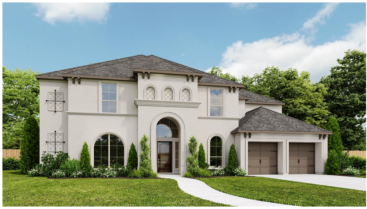
DESIGN 4190W E-90