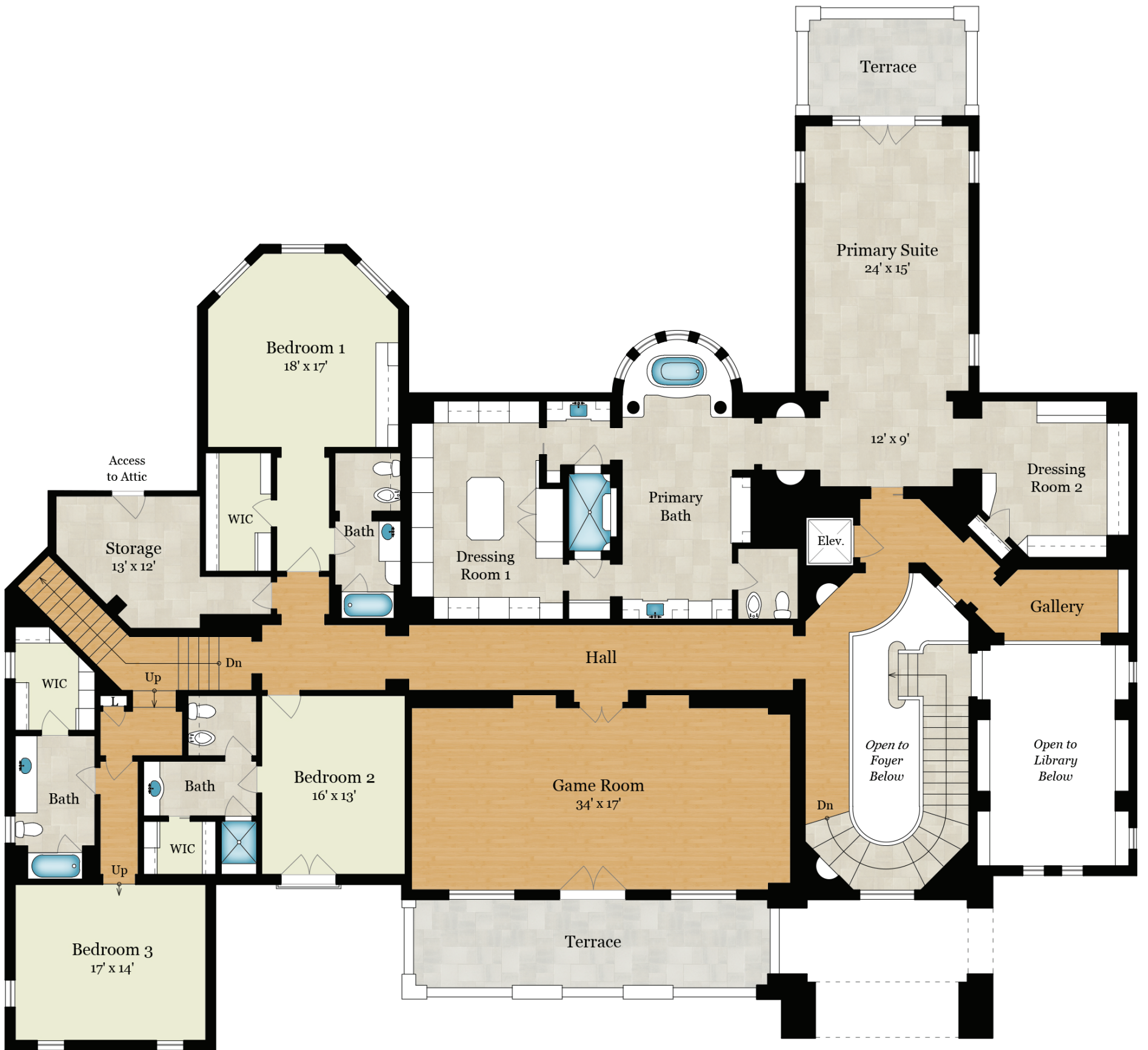
UPPER LEVEL 4,945 SQ FT