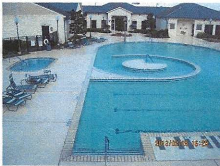
Heated swimming pool

fitness center at the clubhouse is available 24/7.