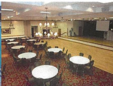
ballroom and stage