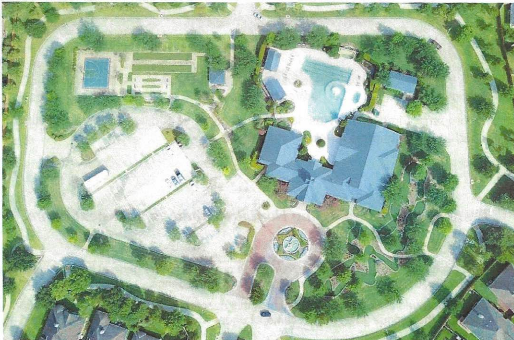
Aerial view of Heritage Circle enclosing common property of Heritage Grand

A monthly HOA assessment fee is required. Please refer to the attached table for the assessment fee amount and a summary of amenities provided by the fee.