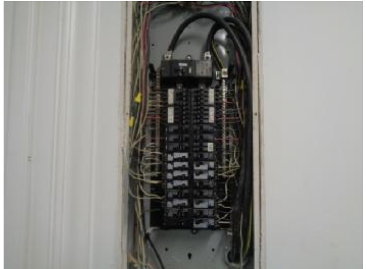
Electric panel with the cover removed