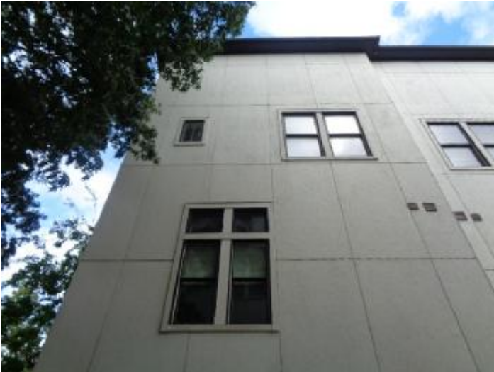
Rear of townhouse