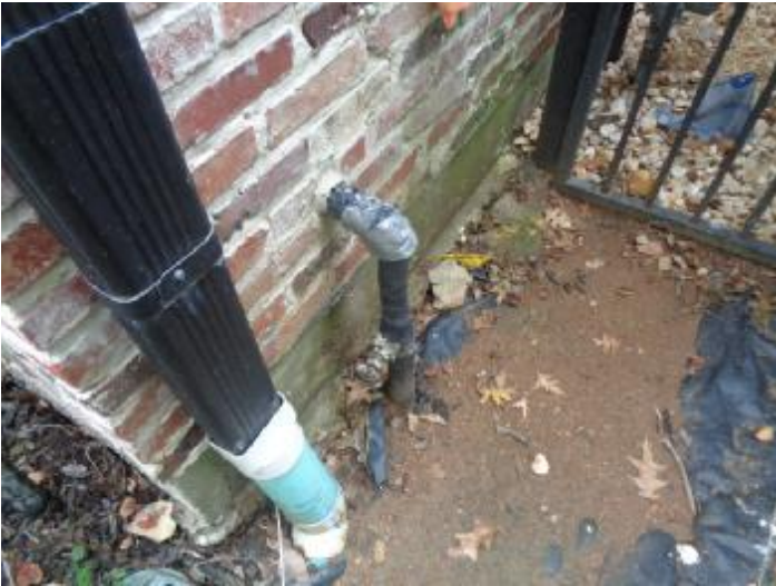
Main water shut off