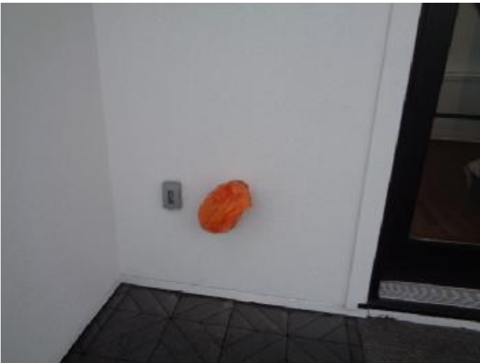
Exterior hose faucet is winterized