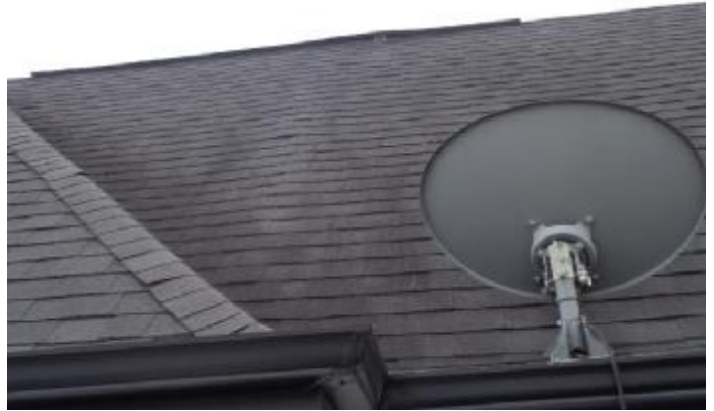
Raised shingles at front of roof