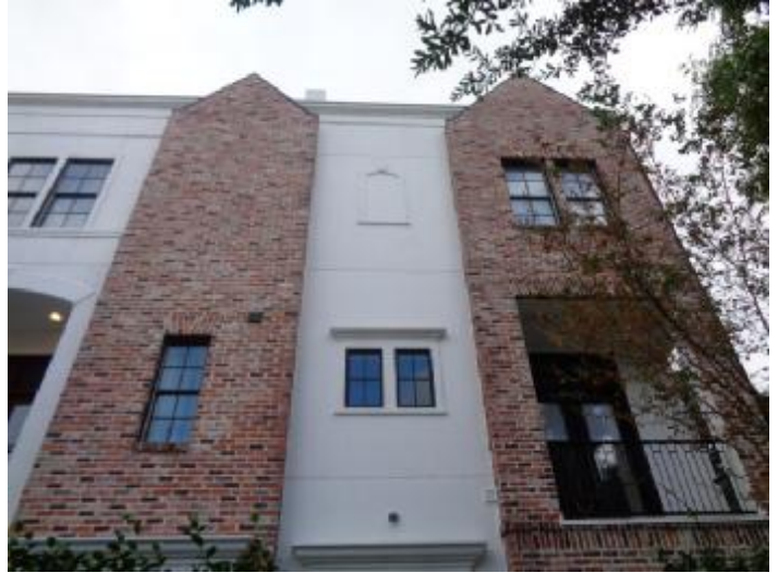
Front of townhouse