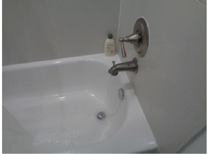
Shower diverter does not completely divert all water from tub spout to shower head when in shower position in downstairs bath