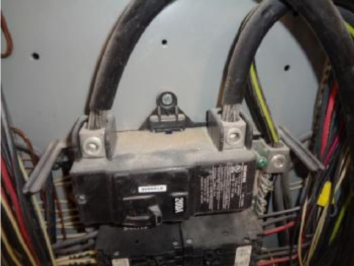
No anti-oxidant paste at the aluminum service wire connections in the electric panel