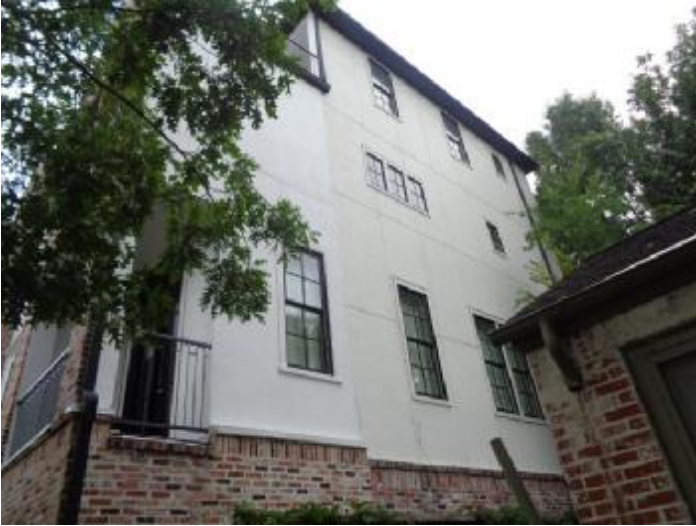
Right side of townhouse