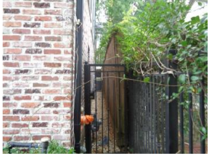
Right side of townhouse