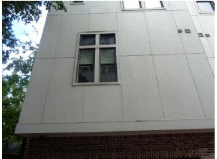
Rear of townhouse