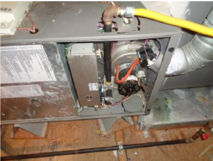
Furnace with the cover removed