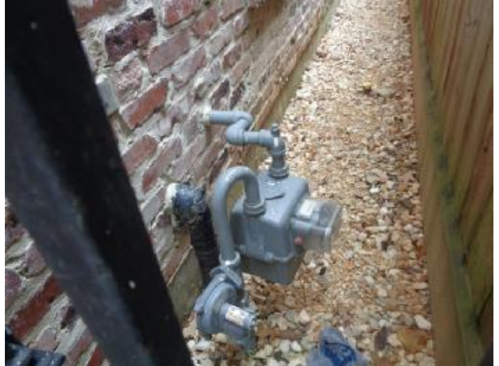
No visible bond/ground wire to main gas pipe