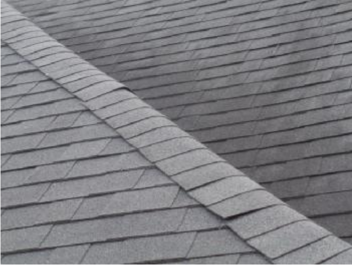
Raised shingles at front of roof