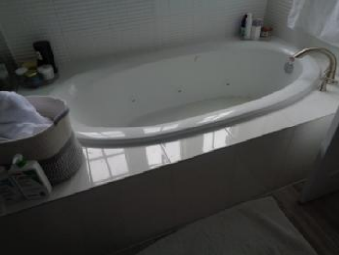
No visible access panel to whirlpool tub equipment