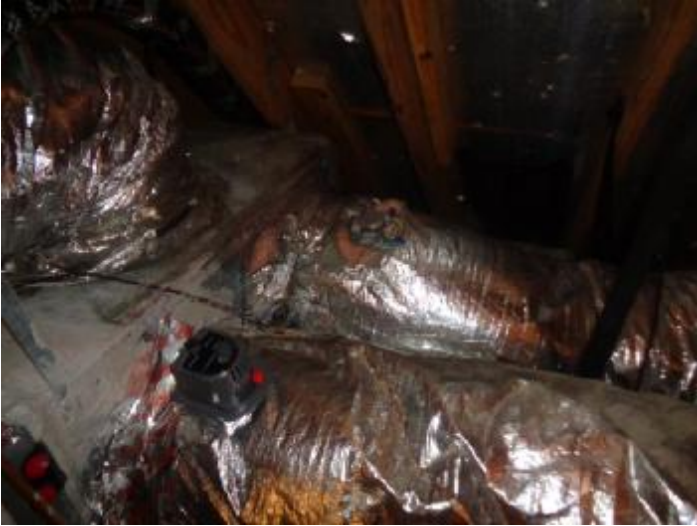
Damaged HVAC ducts in attic