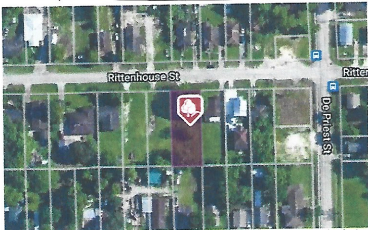
Map data ©2021 Imagery ©2021, Houston-Galveston Area Council, Maxar Technologies, Texas General Land Office, U.S. Geological Survey