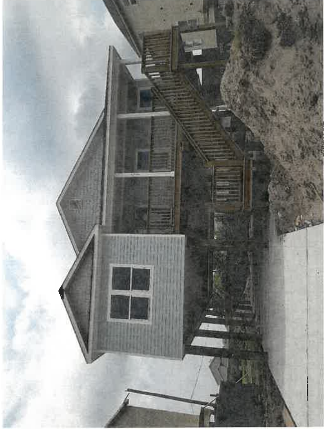
Photo One Caption Front of Home 8-11-2022

If using the Elevation Certificate to obtain NFIP flood insurance, affix at least 2 building photographs below according to the instructions for Item A6. Identify all photographs with date taken; "Front View" and "Rear View"; and, if required, "Right Side View" and "Left Side View." When applicable, photographs must show the foundation with representative examples of the flood openings or vents, as indicated in Section A8. If submitting more photographs than will fit on this page, use the Continuation Page.