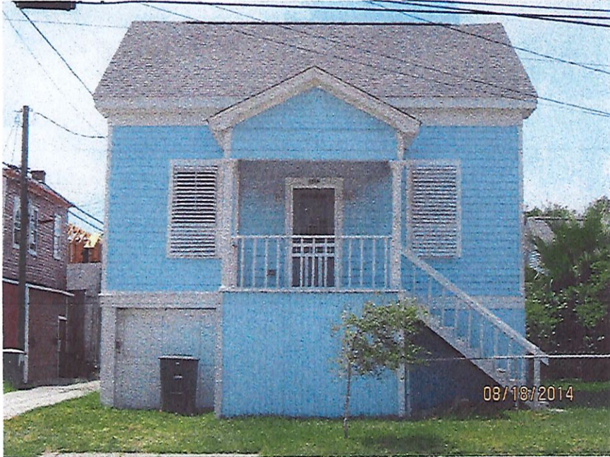
Picture Taken August 18, 2014