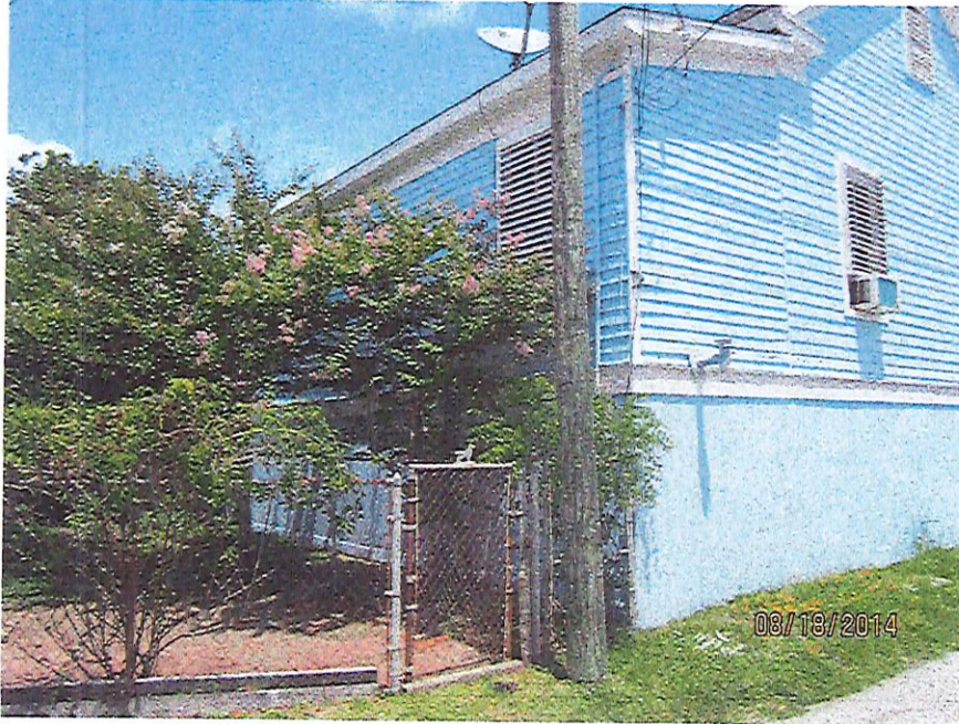
Picture Taken August 18, 2014