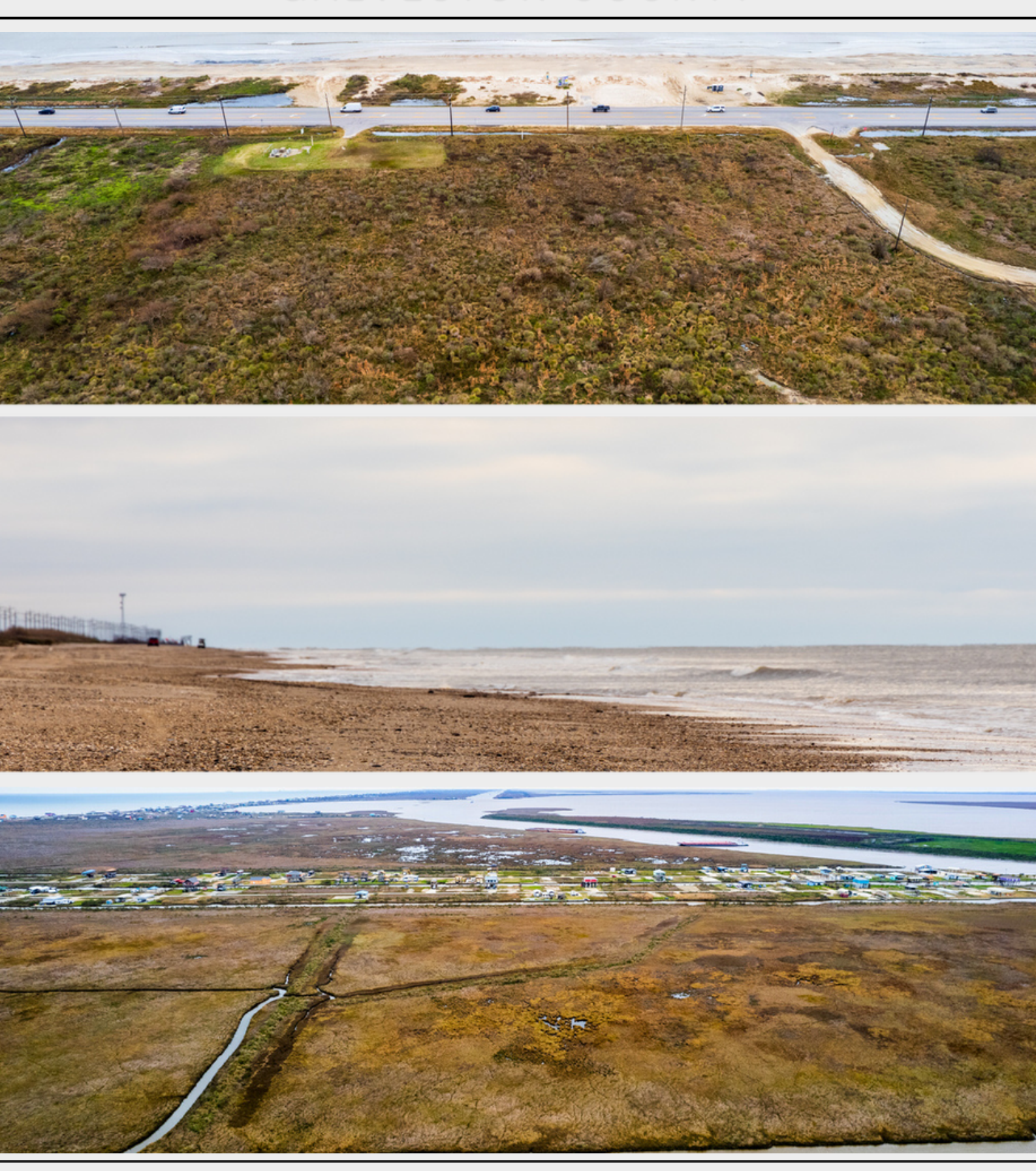
All information is deemed reliable, but is not warranted by MOCK RANCHES GROUP. All information is subject to change without prior notice.