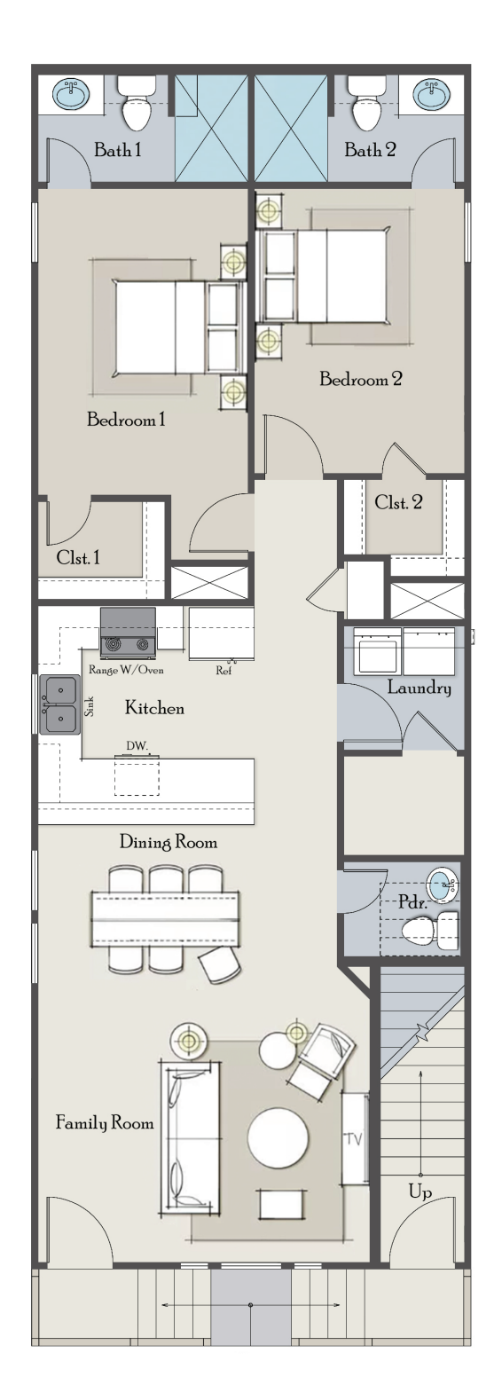
UNIT A 1ST FLOOR - 1,100 SQFT