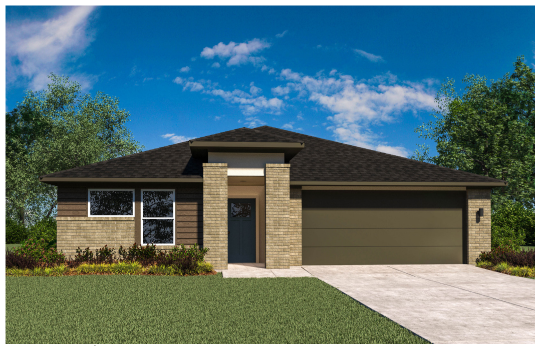
Elevation N w/ Optional Woodtone