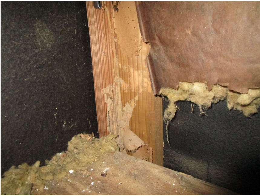
Subterranean termite damage