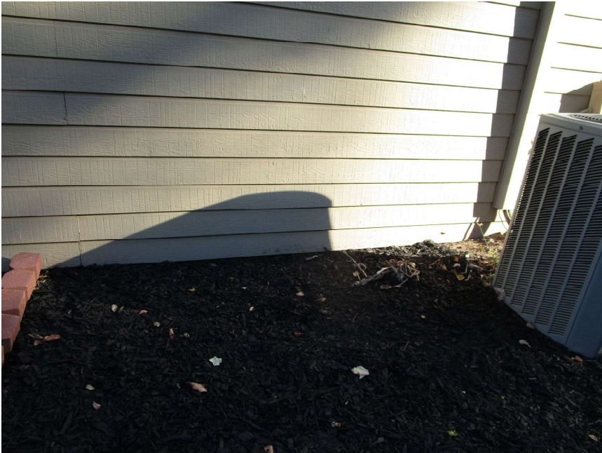
Soil line too high