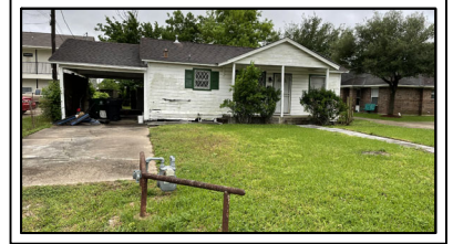
4640 MAYFLOWER STREET

THIS PROPERTY IS NOT IN THE 100 YEAR FLOOD ZONE.