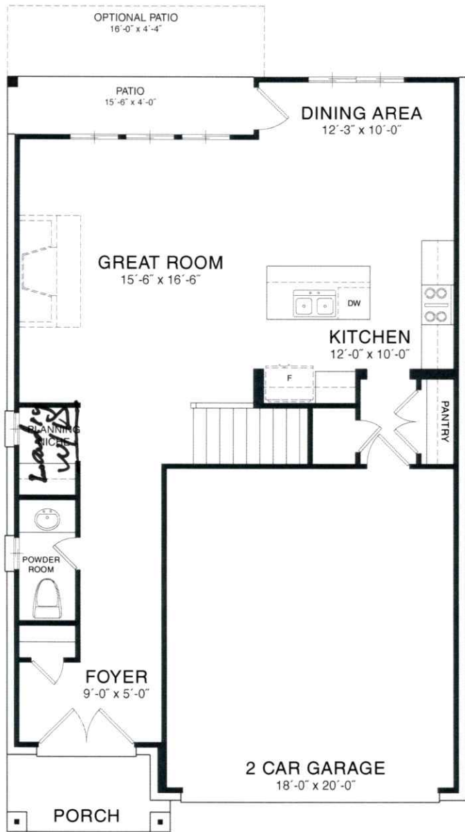
MAIN FLOOR PLAN STYLE D