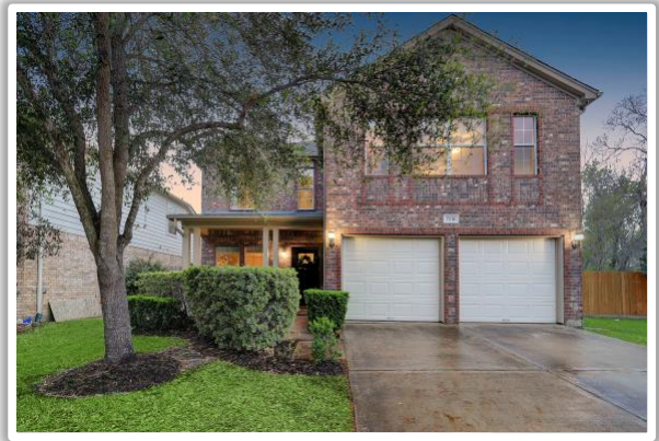
Two-story premium corner lot in cul-de-sac, no back neighbors or right side.