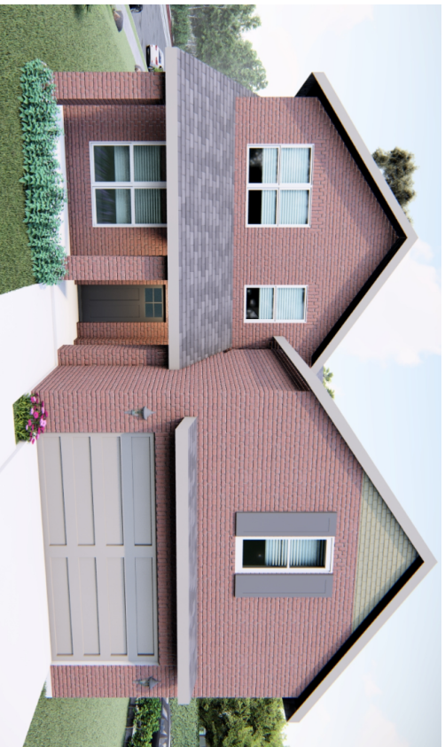
Elevation C – with Glenwood Blend Brick