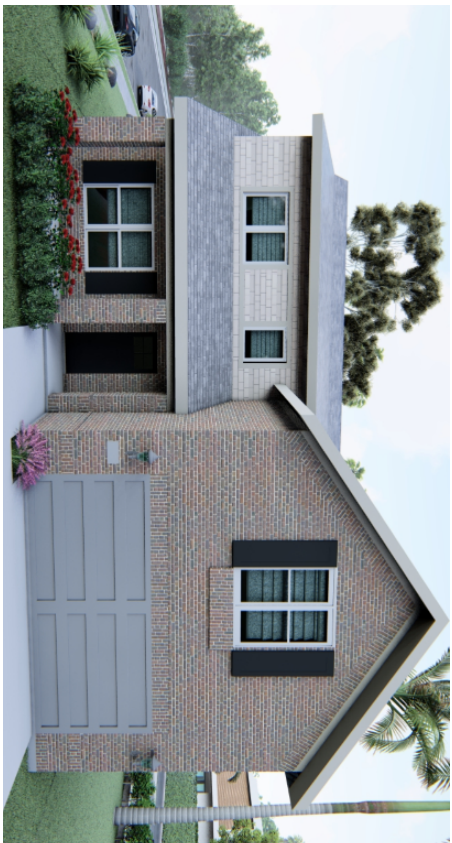
Elevation A – with Winslow Blend Brick