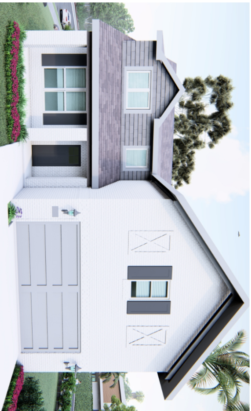
Elevation B – with Alpine Fog Brick