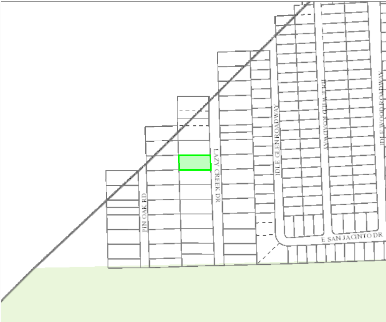
Lot 36. Harris County-Lazy Creek Map.3-15-2022