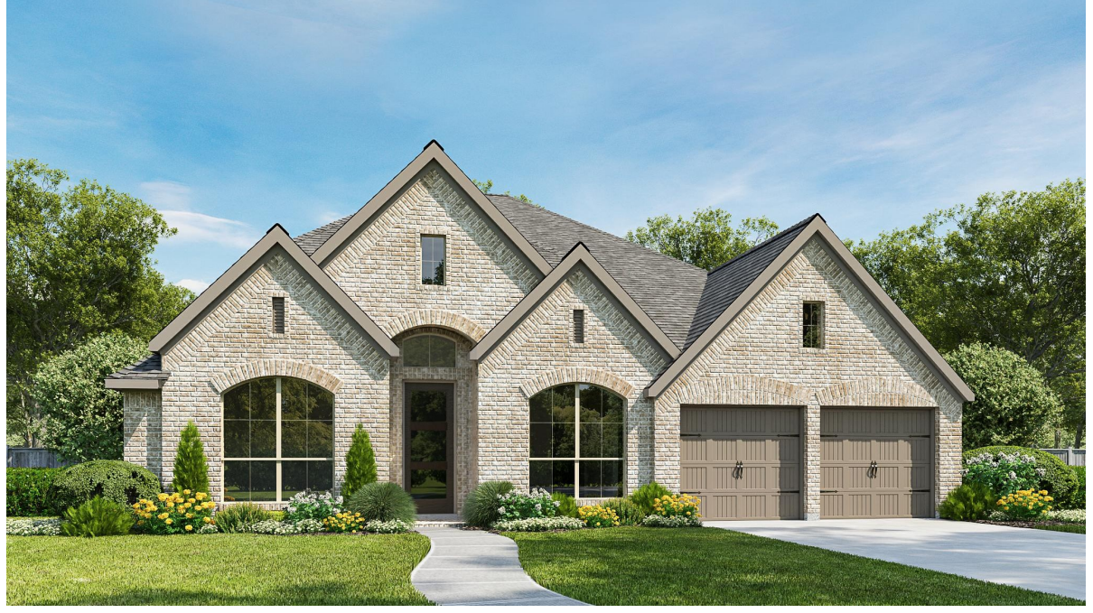
DESIGN 3258W E-1