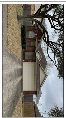
4317 PLOVER STREET

BEING LOT 5, BLOCK 3, BAYBROOK SECTION 3, A SUBDIVISION IN HARRIS COUNTY, TEXAS ACCORDING TO THE MAP OR PLAT THEREOF RECORDED IN VOLUME 323, PAGE 029 MAP RECORDED OF HARRIS COUNTY, TEXAS.