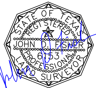
JOHN D. FISHER R.P.L.S. NO. 6153

FLOOD INFORMATION *BASED ON VISUAL EXAMINATION, THIS TRACT LIES WITHIN ZONE "X" DEFINED AS "AREAS DETERMINED TO BE OUTSIDE THE 0.2% ANNUAL CHANCE FLOODPLAIN" PER F.E.M.A. FLOOD INSURANCE RATE MAP PANEL NO: 48201C0295M REVISION DATE: 06-09-2014. *DUE TO INACCURACIES OF F.E.M.A. MAPS PREVENT EXACT DETERMINATION WITHOUT DETAILED FIELD STUDIES.