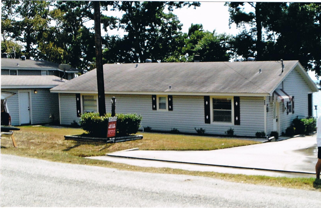
FRONT VIEW 09 /13 /2013

If using the Elevation Certificate to obtain NFIP flood insurance, affix at least 2 building photographs below according to the instructions for Item A6. Identify all photographs with date taken; "Front View" and "Rear View"; and, if required, "Right Side View" and "Left Side View." When applicable, photographs must show the foundation with representative examples of the flood openings or vents, as indicated in Section A8. If submitting more photographs than will fit on this page, use the Continuation Page.