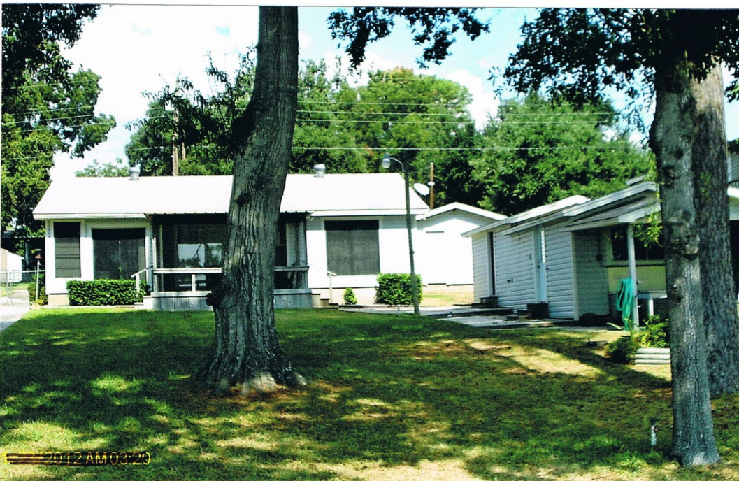
REAR VIEW 09 /13 /2013