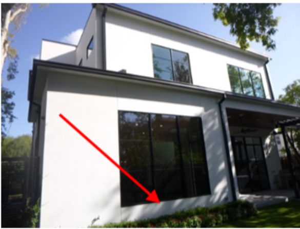
Identify location to probe

The first part of the invasive stucco inspection is a visually survey of the stucco system. During the visual inspection we identify locations that are known to be susceptible to water intrusion, also taking note of any other areas that appear to be vulnerable to water intrusion or show evidence of water intrusion. These areas are then probed to determine the moisture content of the substrate behind the stucco and the integrity of those materials. After the probing process is complete, we seal up the probe points with a high quality exterior sealant. The sealants we employ are the same type sealants that were used by the builder to seal all openings and penetrations in the stucco system during construction.