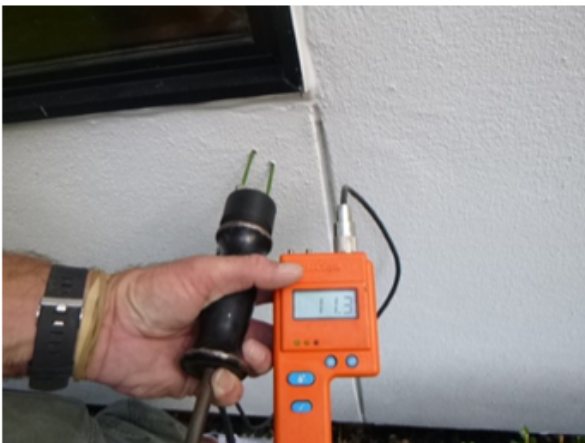
Take moisture reading with meter