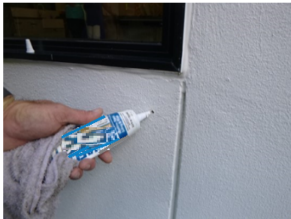
Seal holes with approved exterior caulk