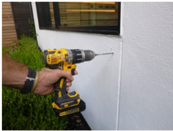
Drill two small (3/16 - 1/4") probe points for moisture probe access