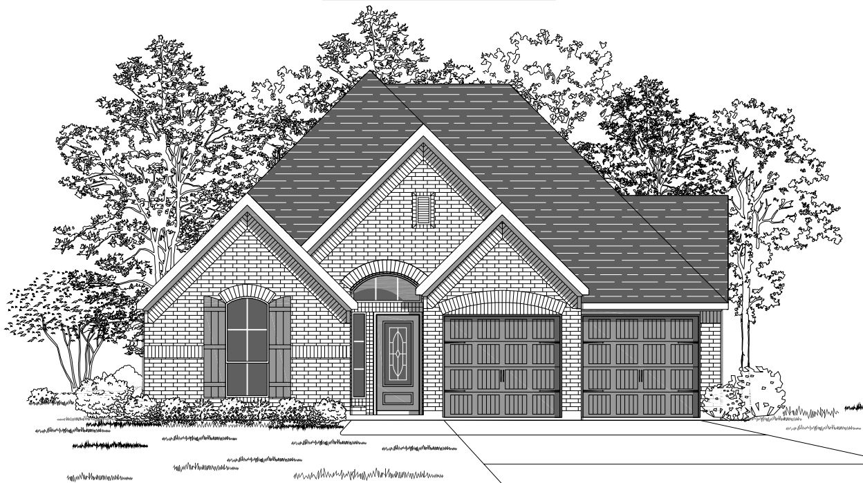
Design 1813W E-2