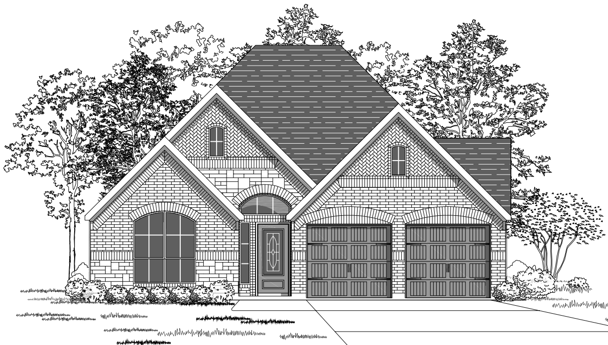
Design 1813W E-30

This design, as originally designed and prior to any changes you make, is estimated to yield approximately the number of square feet shown on page 1. All dimensions are approximate. Square footage may vary based on as-built dimensions, configurations, plan options and/or the method of calculation. Designs are not-to-scale, and are conceptual illustrations that may differ from construction plans or completed improvements. A design may depict features not available on all homesites or in all communities. Perry Homes reserves the right to make changes in plans and specifications, and to substitute material of similar quality. Prices, terms, promotions, plans, dimensions, features, options, amenities, elevations, designs, square footages, specifications, materials, and availability of homes or communities are subject to change without notice or obligation. All obligations will be governed by a written contract. This design does not constitute a commitment to build a particular floor plan or home in any given community. Some floor plans, options, and/or elevations may not be available on certain homesites or in a particular community and may require additional charges. Please check with Perry Homes to verify current offerings in the communities you are considering. This rendering is the property of Perry Homes, LLC. Any reproduction or exhibition is strictly prohibited.