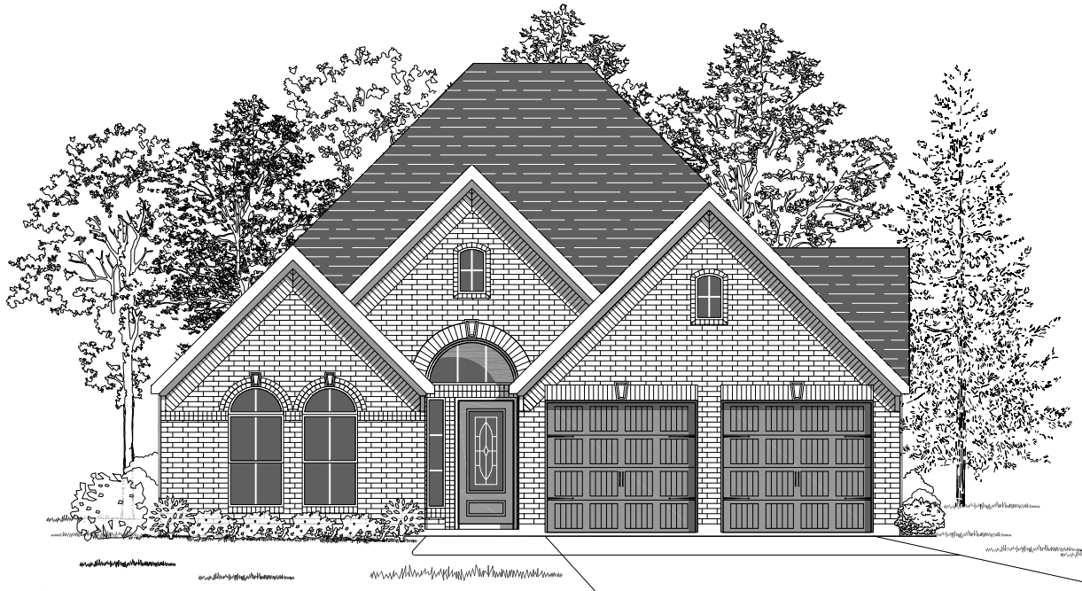
Design 1813W E-1